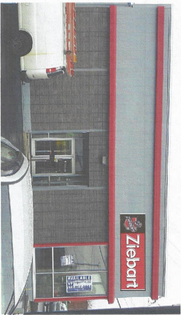
Sign Area - 48 Sq. Ft.