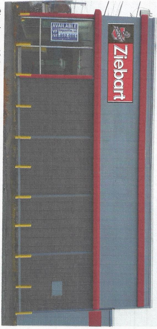
Sign Area - 48 Sq. Ft.