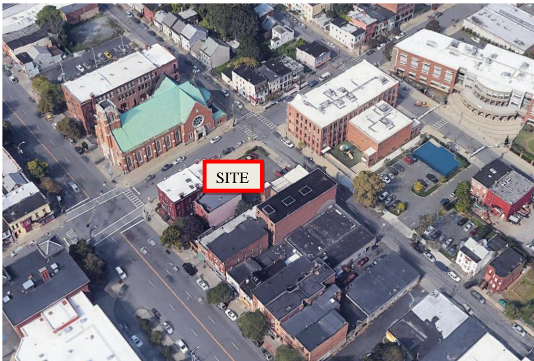
Fig. No. 1 - Aerial Photo of Existing Site

The project area is currently occupied by the Hospitality House 72 bed residential facility. There is a 3-story structure on Central Avenue with a one-story addition to the rear of No. 269 Central Avenue. There is a 7-car parking lot on the Sherman Street side accessed from Sherman Street. The existing operation requires 38 employees working in 3 shifts. The proposal will consolidate four lots at No. 269 Central Avenue (TID #’65.63-2-68), No. 271 Central Avenue (TID #’65.63-2-69), No. 98 North Lake Avenue (TID #’65.63-2-70) & No. 260 Sherman Street, (TID #’65.63-2-71) into a single lot with the address of No. 271 Central Avenue having an area of 12,480 SF or 0.29 acre. Aerial view of the site is shown in Fig. No. 1.