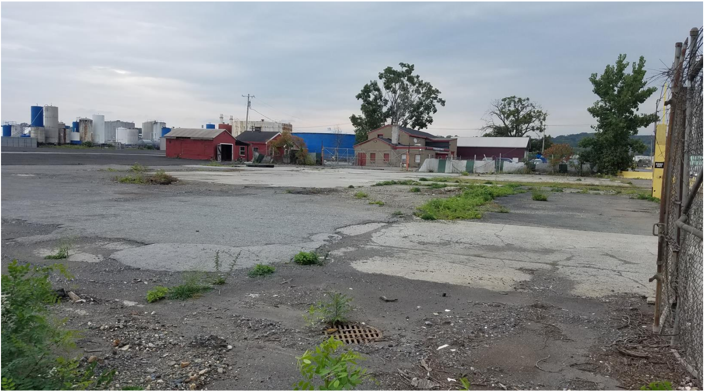
Photo #5 –Existing Site Along Raft St Looking East (Existing Building Foundations)