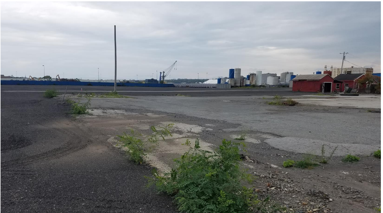
Photo #4 –Existing Site From Center Looking NE (Crushed Millings Remediation Cap & Existing Building Foundations)