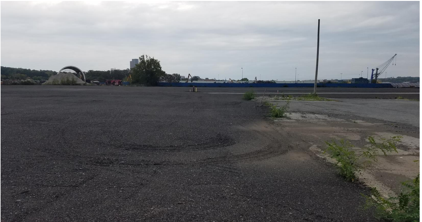
Photo #3 –Existing Site Looking North (Crushed Millings Remediation Cap & Existing Building Foundations)