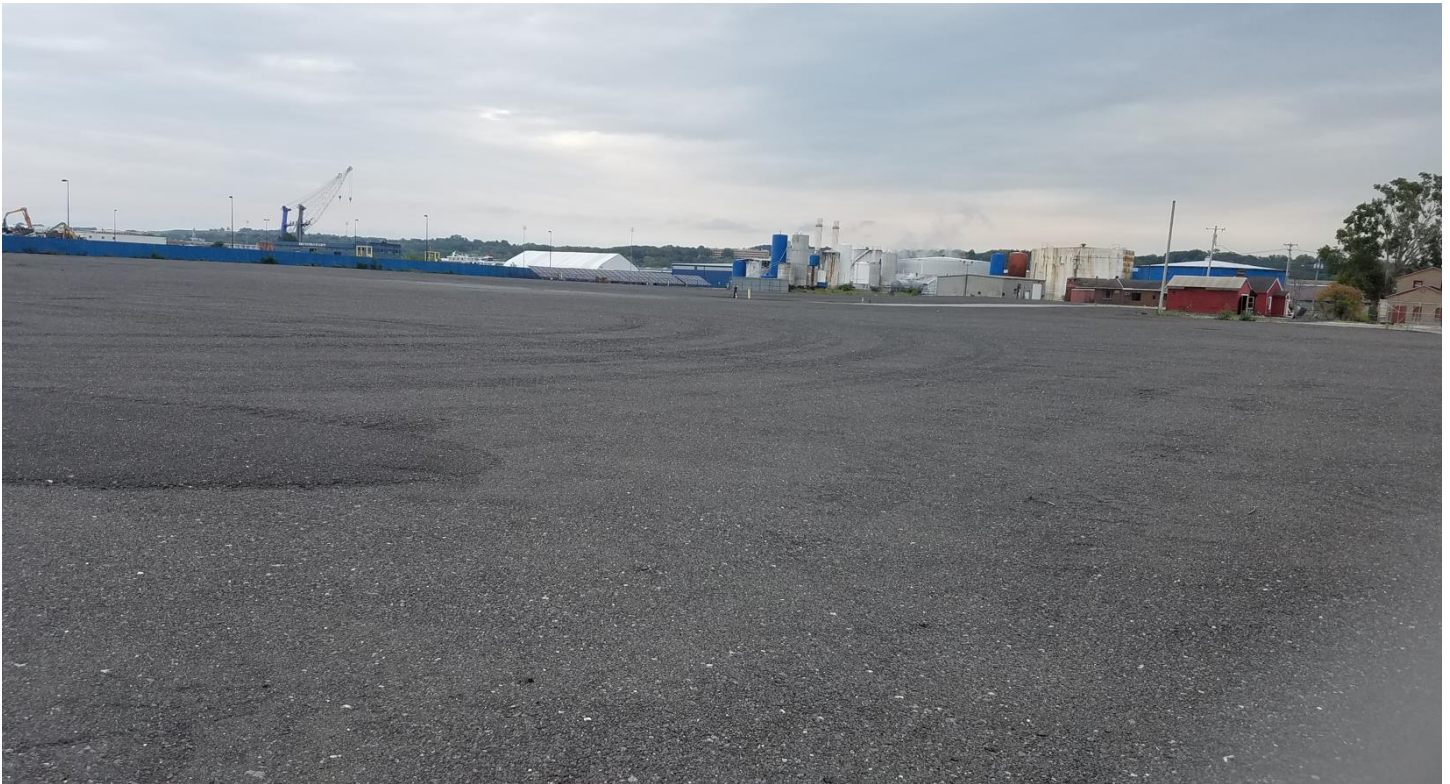
Photo #1 –Existing Site From SE Looking NE (Crushed Millings Remediation Cap)