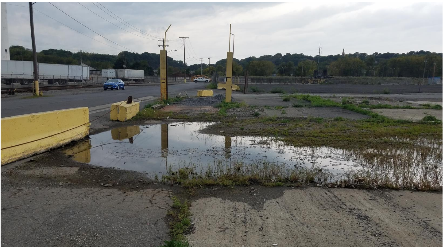
Photo #6 –Existing Site Along Raft St Looking West (Existing Building Foundations)