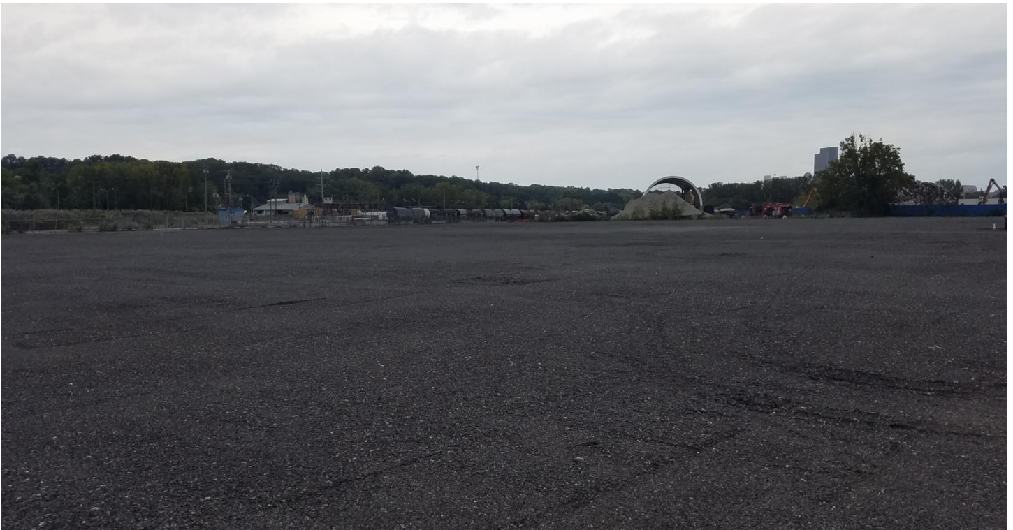
Photo #2 –Existing Site Looking NW (Crushed Millings Remediation Cap)