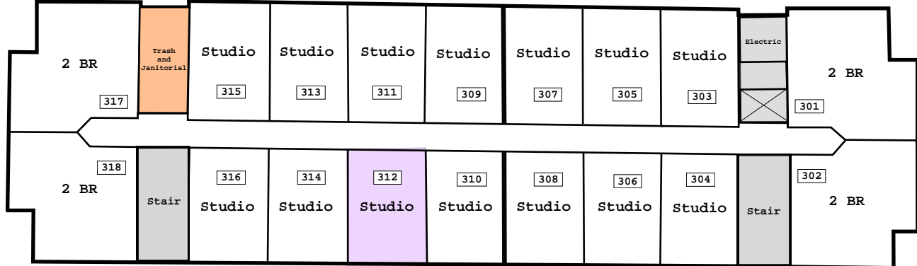
Building A Third Floor Plan

Purple units have been identified as Affordable Units as required by the City of Albany's USDO Affordable Housing Compliance Plan. Yellow areas are active or passive recreation areas.