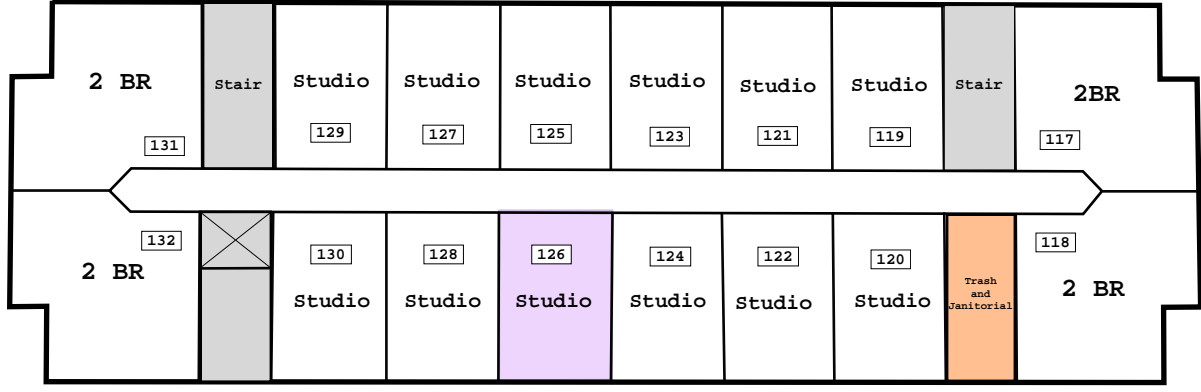
Building B First Floor Plan