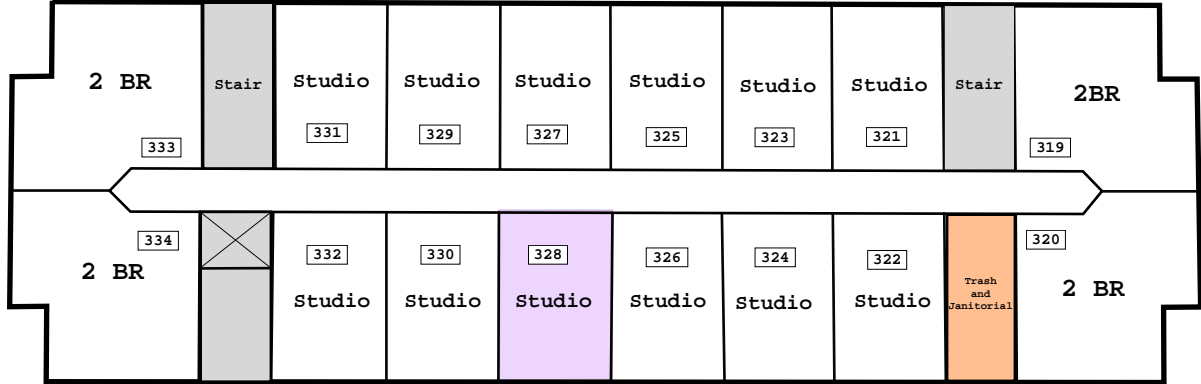
Building B Third Floor Plan