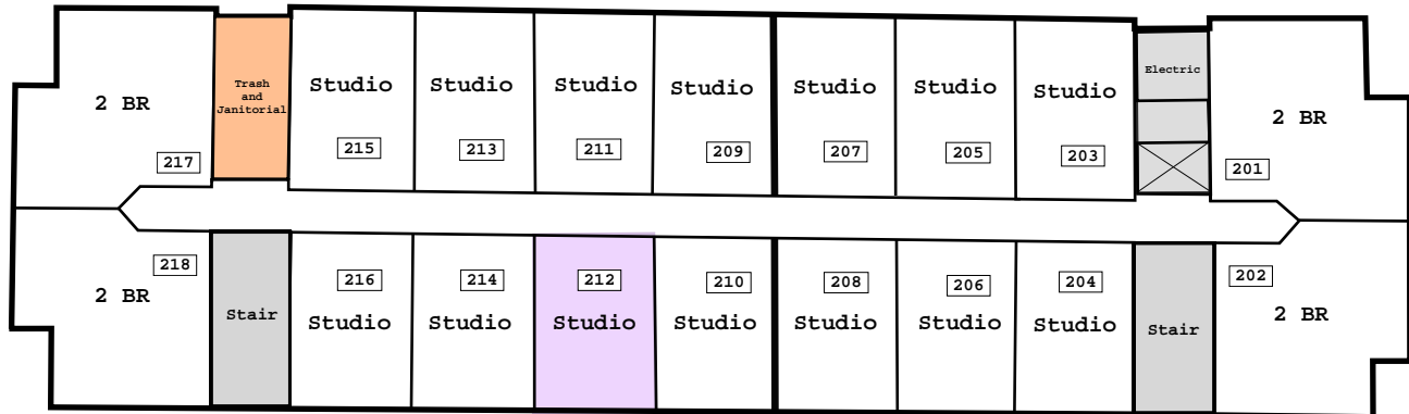
Building A Second Floor Plan

Purple units have been identified as Affordable Units as required by the City of Albany's USDO Affordable Housing Compliance Plan. Yellow areas are active or passive recreation areas.