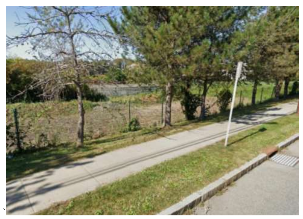
Six-foot Chain-Link fence constructed by the City of Albany to secure a storm water basin constructed as part of improvement of Whitehall Road

Another element are fences in front yard. Pictures below identify fences higher than 4 feet with non-conforming opacity and materials.