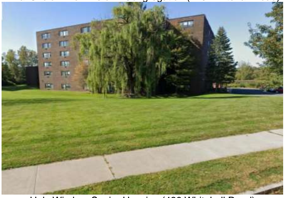
Holy Wisdom Senior Housing (426 Whitehall Road)