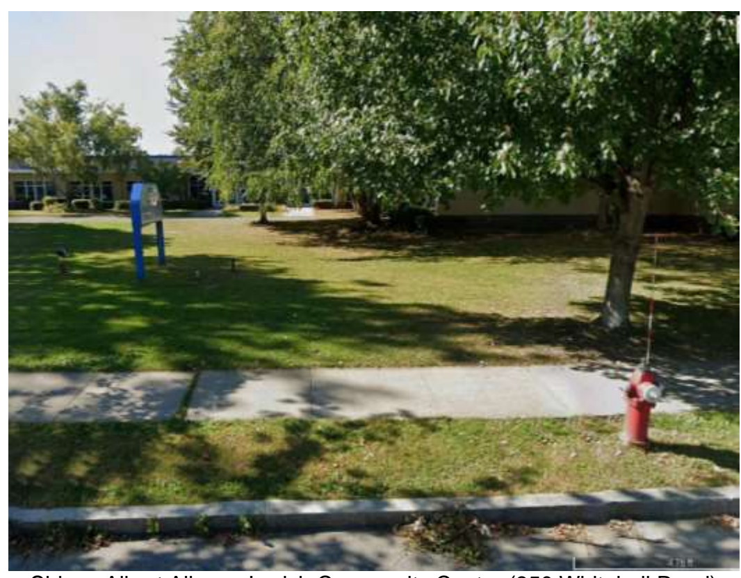
Sidney Albert Albany Jewish Community Center (350 Whitehall Road)