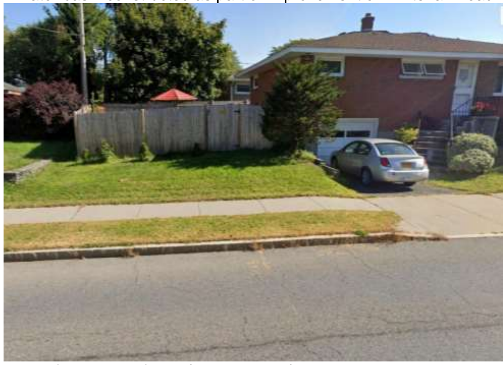
6-foot privacy fence (100% opacity) on Whitehall Road side of 2-B Maxwell Street