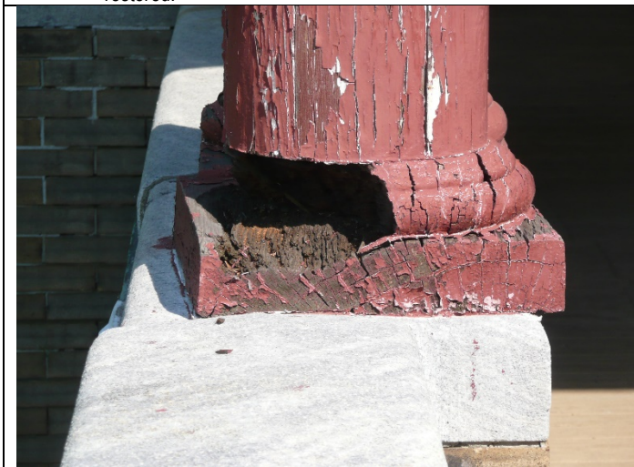
7. Wood columns requiring full restoration.