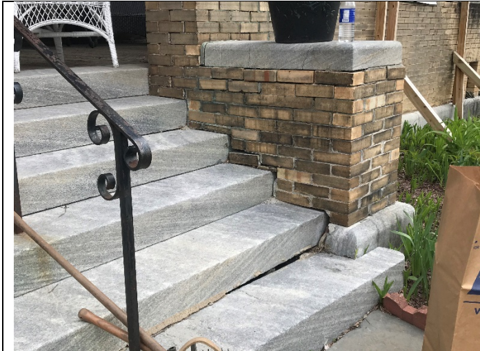
5. Center South Stair. Full rebuilding required; existing railing to be restored.