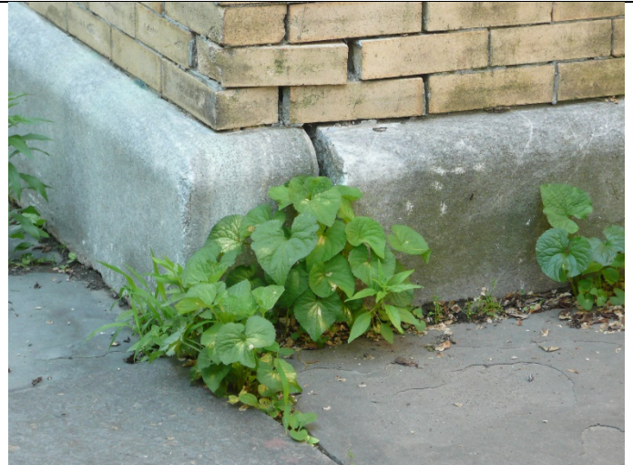
6. Foundation displacement, typical at eastern side of existing porch.