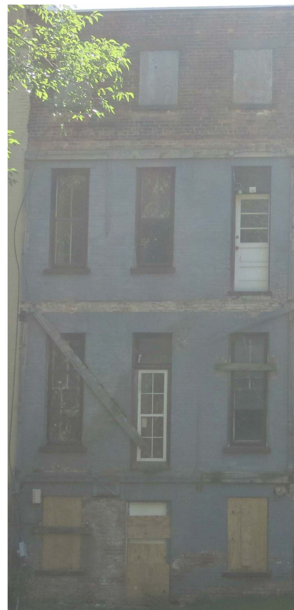
4 REAR ELEVATION 1/4" = 1'-0"

This document illustrates an original design and is the property of 3tarchitects, who retains all common law, statutory, and other reserved rights, including copyright. This document may not be reproduced or used for any purpose without 3tarchitects' consent.