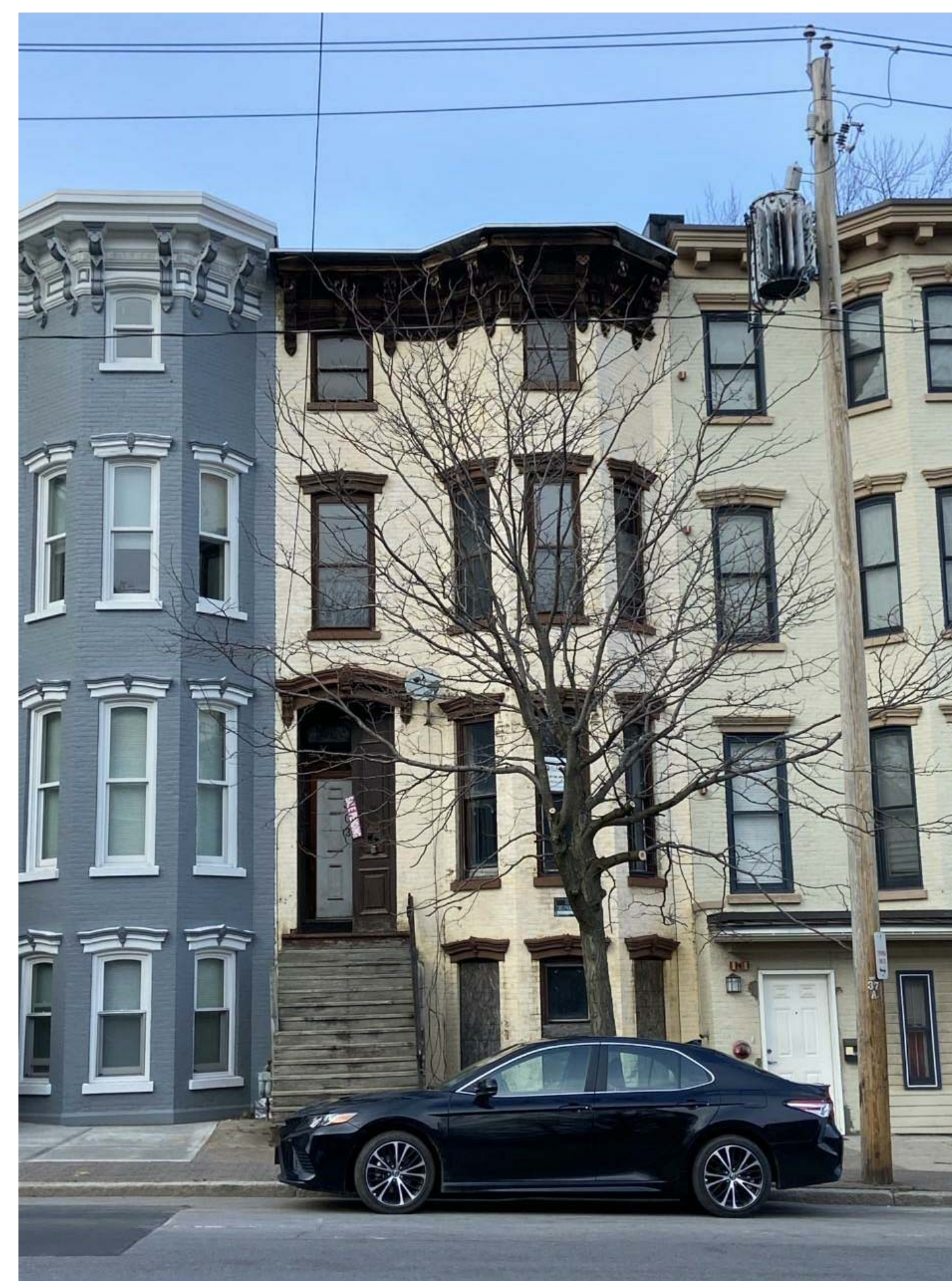
3 STREET ELEVATION 1/4" = 1'-0"