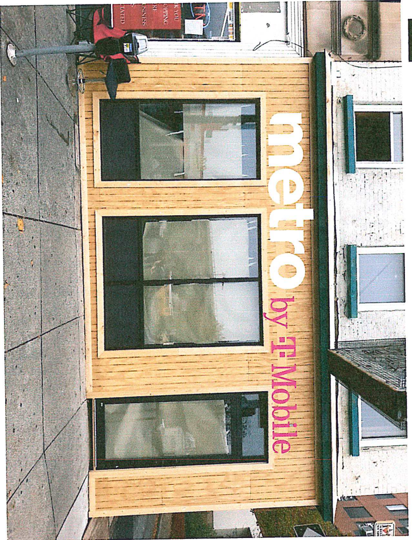
Total Sign Area=24 Sq. Ft.