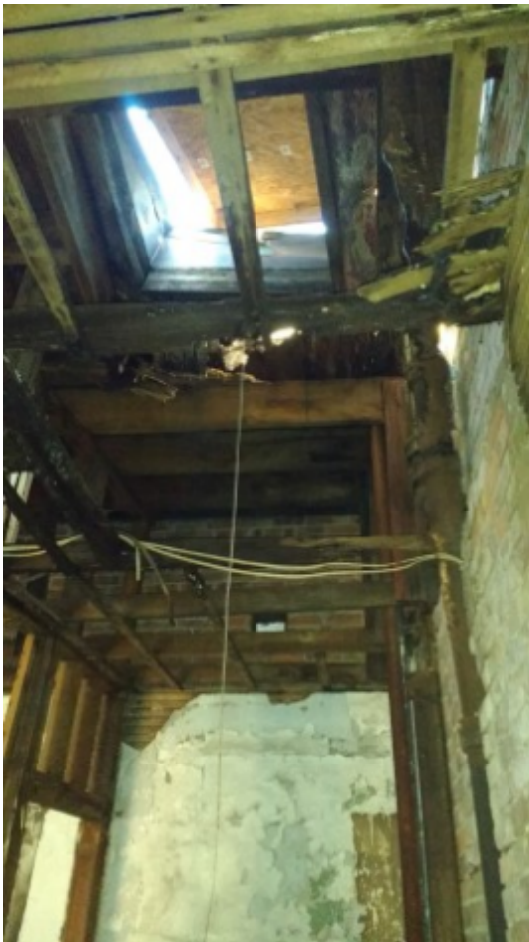
241 Orange St 03.jpg