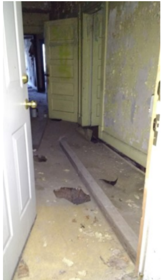
241 Orange St 08.jpg