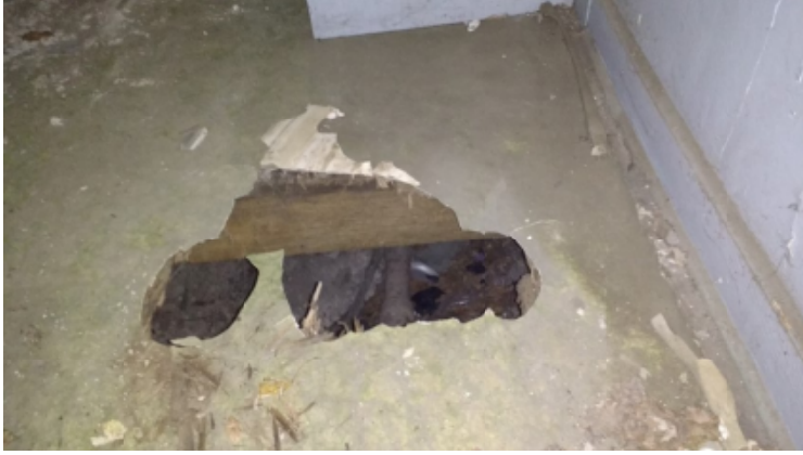
241 Orange St 05.jpg