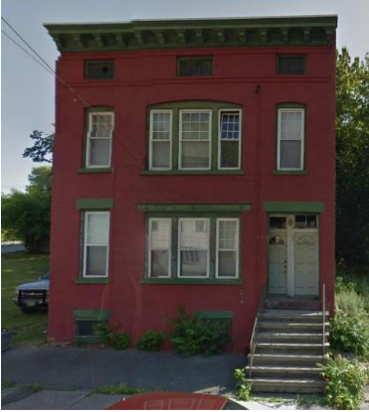
241 Orange St 01.jpg