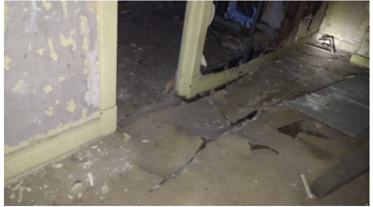
241 Orange St 10.jpg