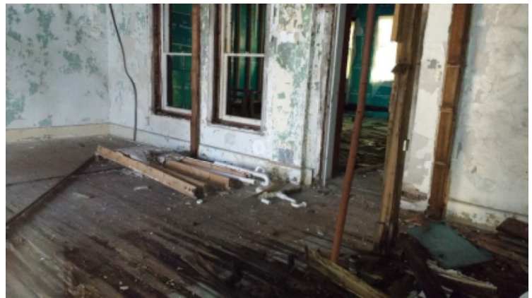
241 Orange St 04.jpg