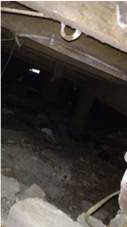
241 Orange St 07.jpg