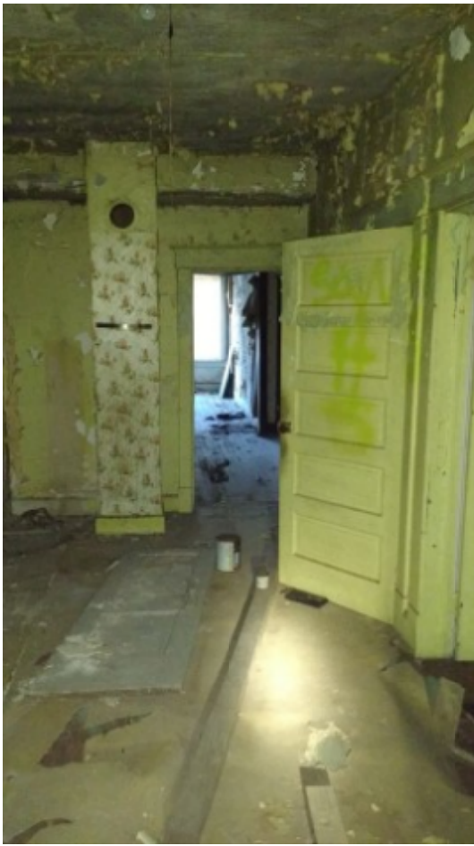
241 Orange St 09.jpg