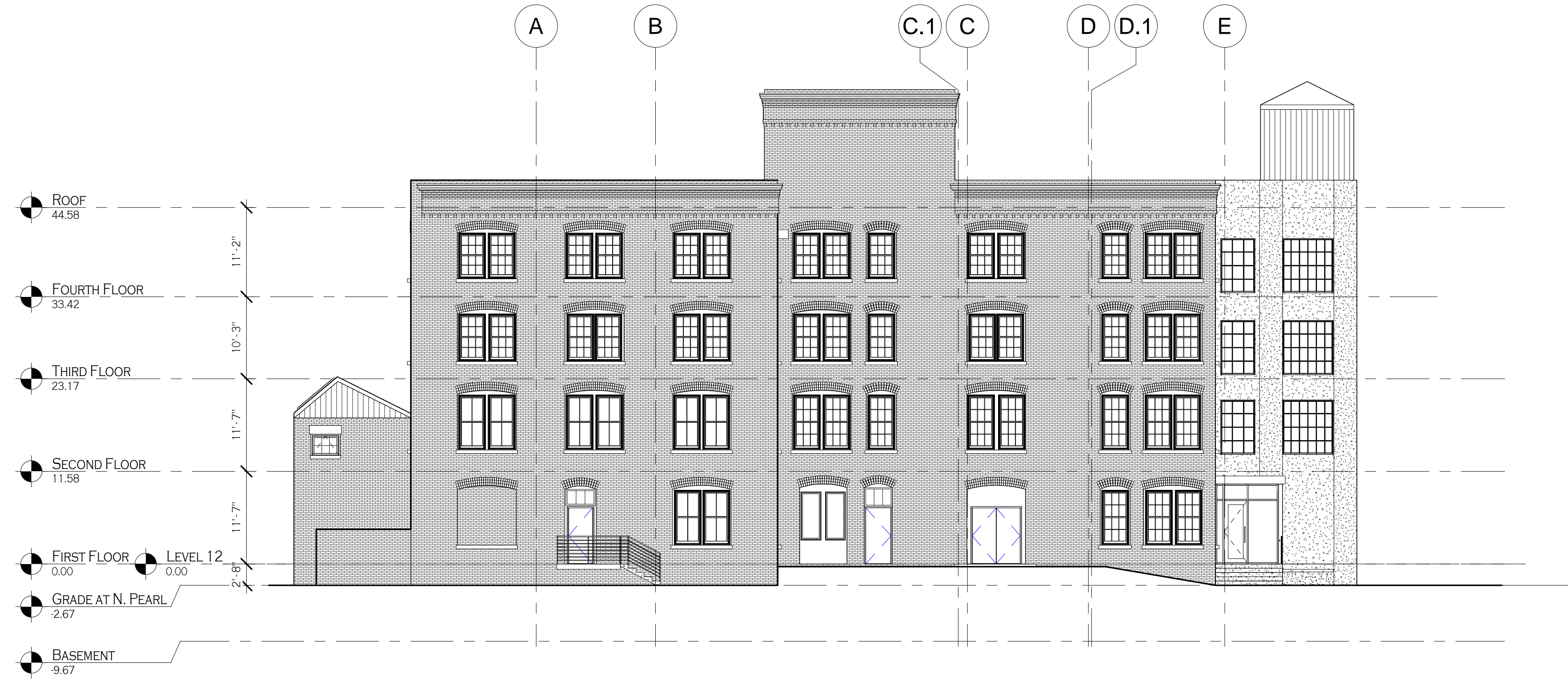
2 WEST ELEVATION A-501 3/32" = 1'-0"