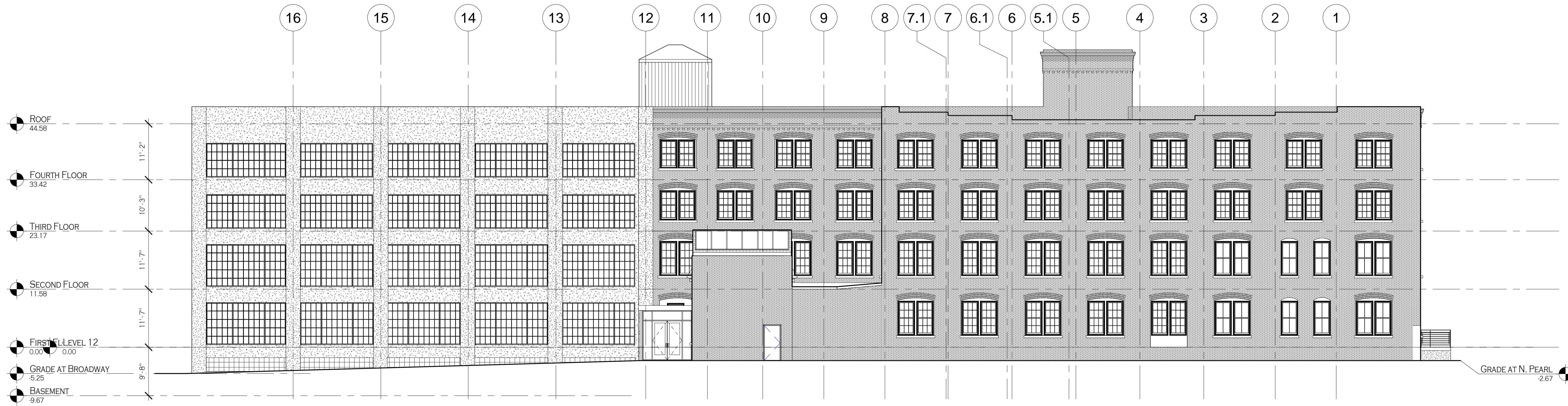
1 NORTH ELEVATION A-500 3/32" = 1'-0"