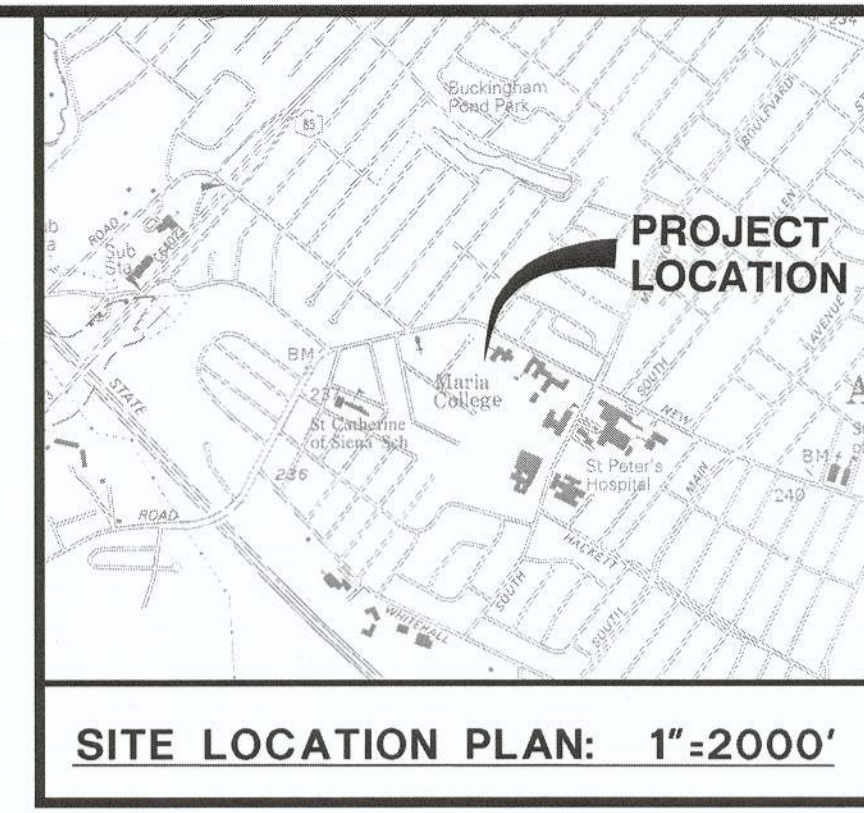
SITE LOCATION PLAN: 1"=2000'