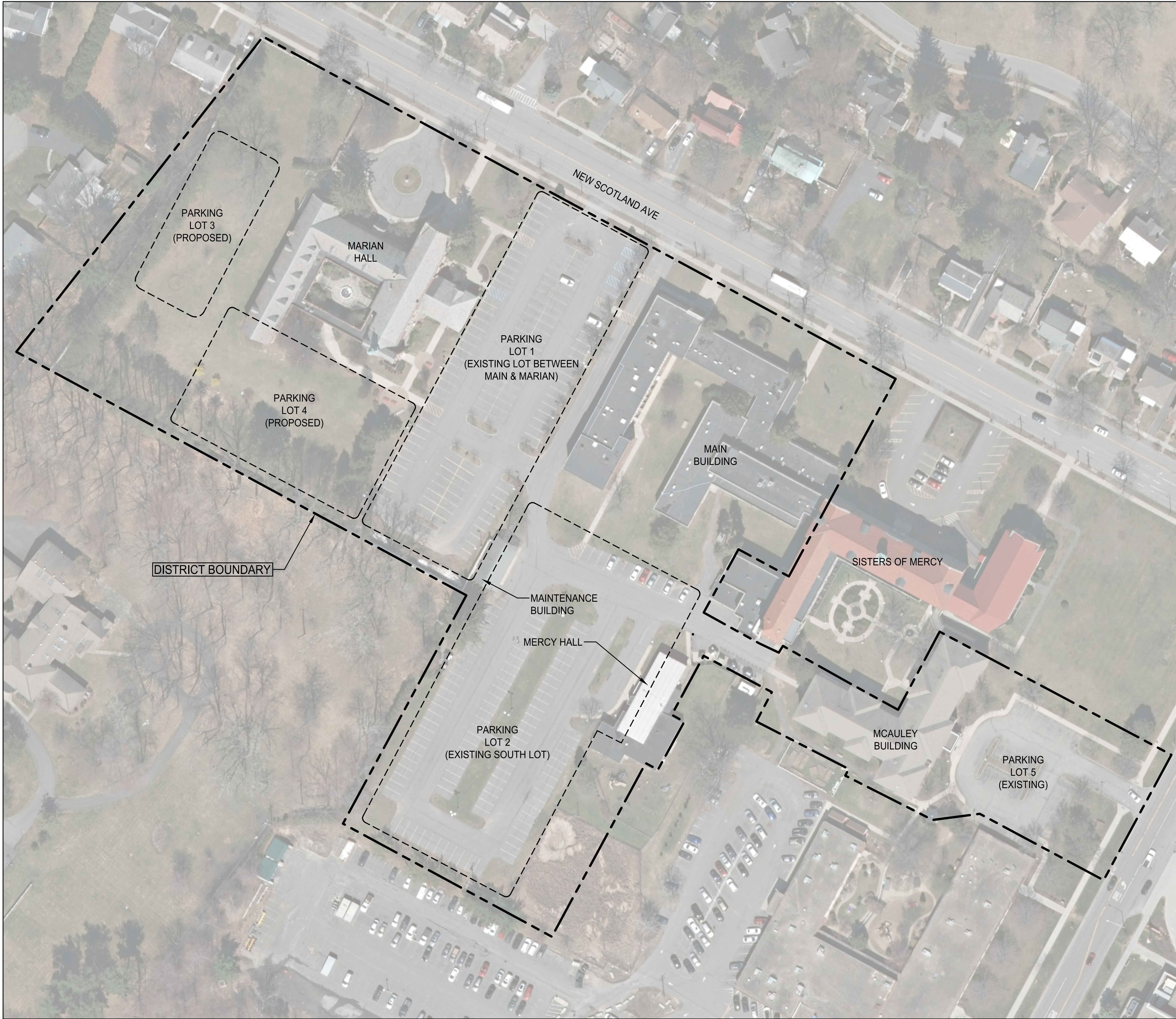
EXISTING CONDITIONS & PARKING AREA MAP