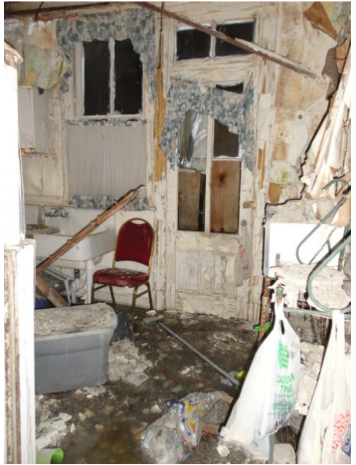
296 Sheridan Ave 06.JPG