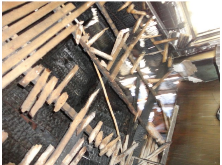
296 Sheridan Ave 12.JPG