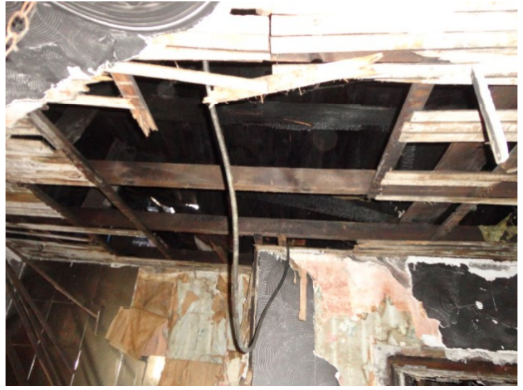
296 Sheridan Ave 10.JPG