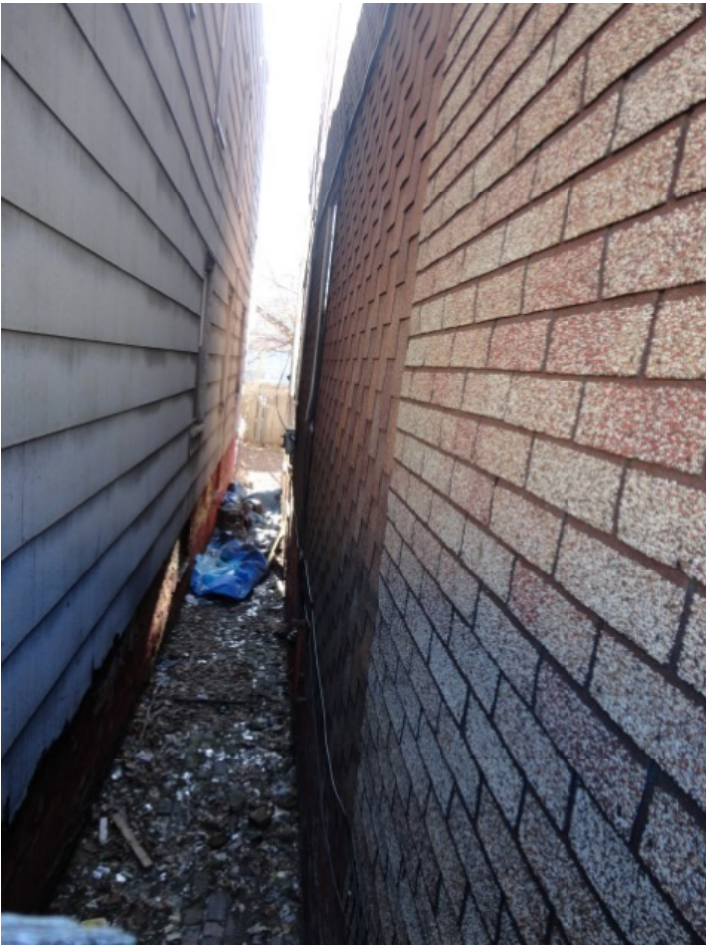
296 Sheridan Ave 13.JPG