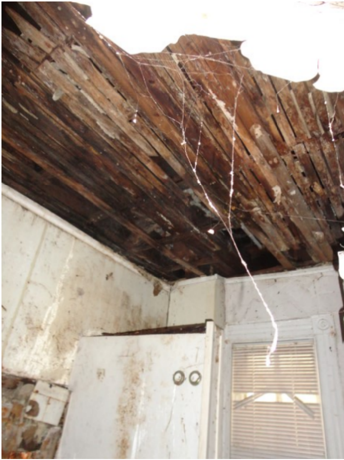
296 Sheridan Ave 05.JPG