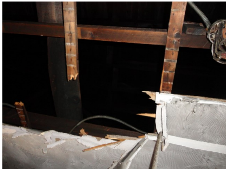
296 Sheridan Ave 08.JPG