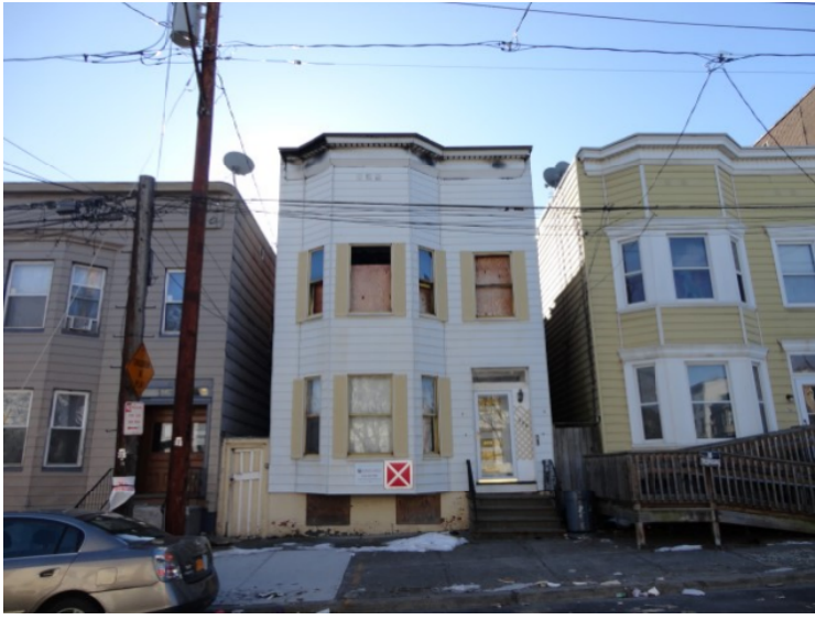
296 Sheridan Ave 01.JPG