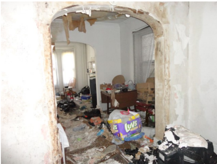
296 Sheridan Ave 03.JPG