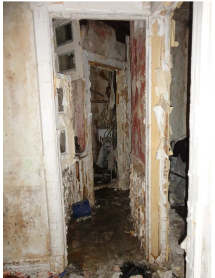
296 Sheridan Ave 04.JPG