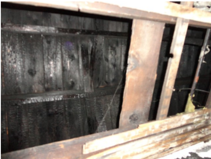
296 Sheridan Ave 11.JPG