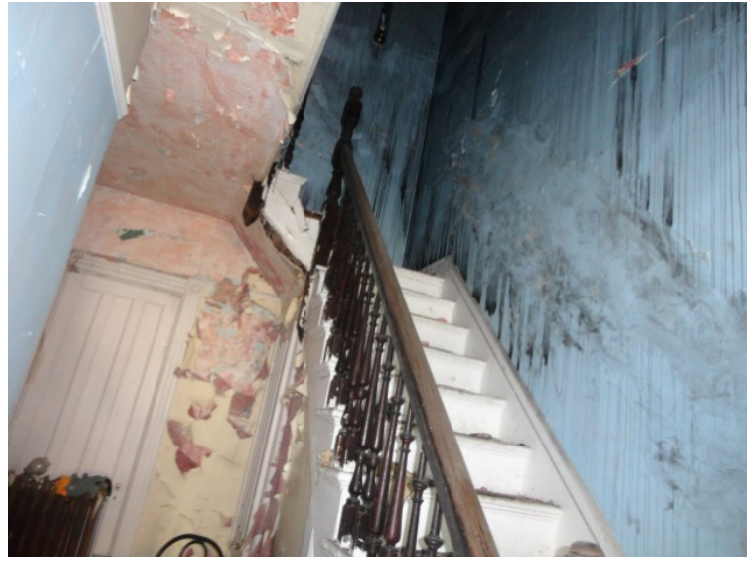
296 Sheridan Ave 02.JPG