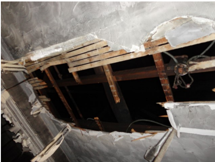
296 Sheridan Ave 07.JPG