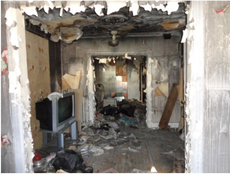
296 Sheridan Ave 09.JPG