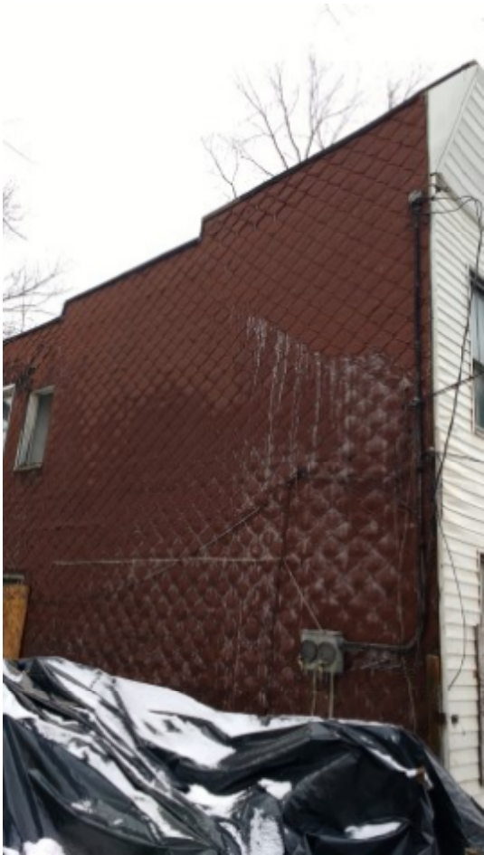
320 Second St 02.jpg