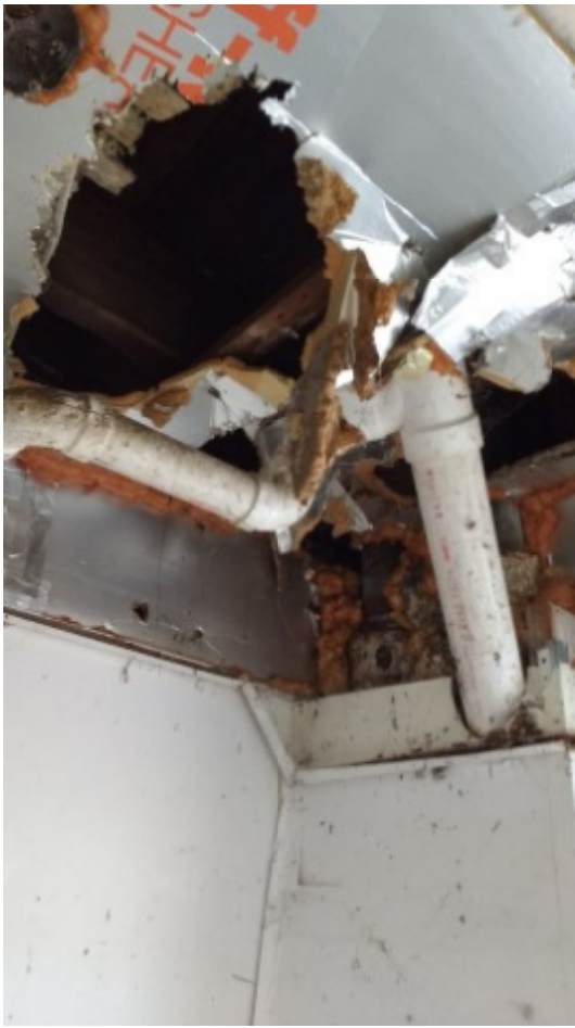
320 Second St 13.jpg