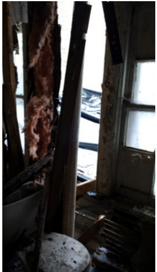
320 Second St 10.jpg