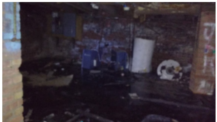
320 Second St 08.jpg