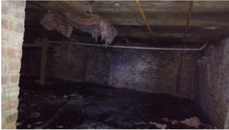
320 Second St 09.jpg