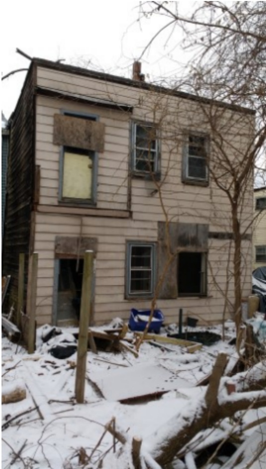
320 Second St 04.jpg