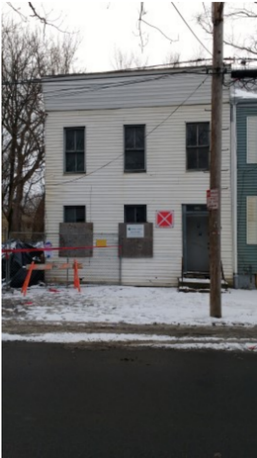
320 Second St 01.jpg