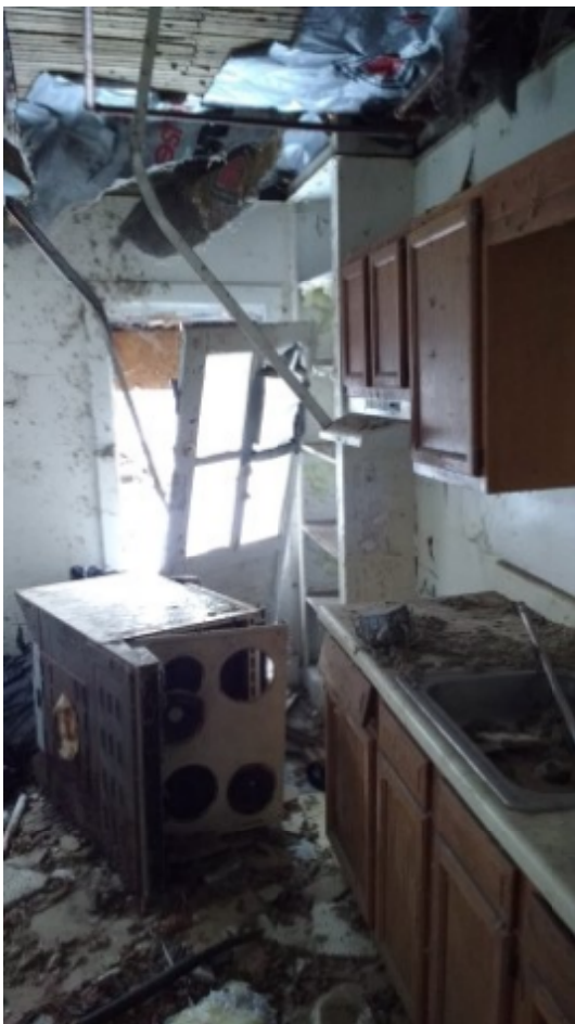
320 Second St 07.jpg