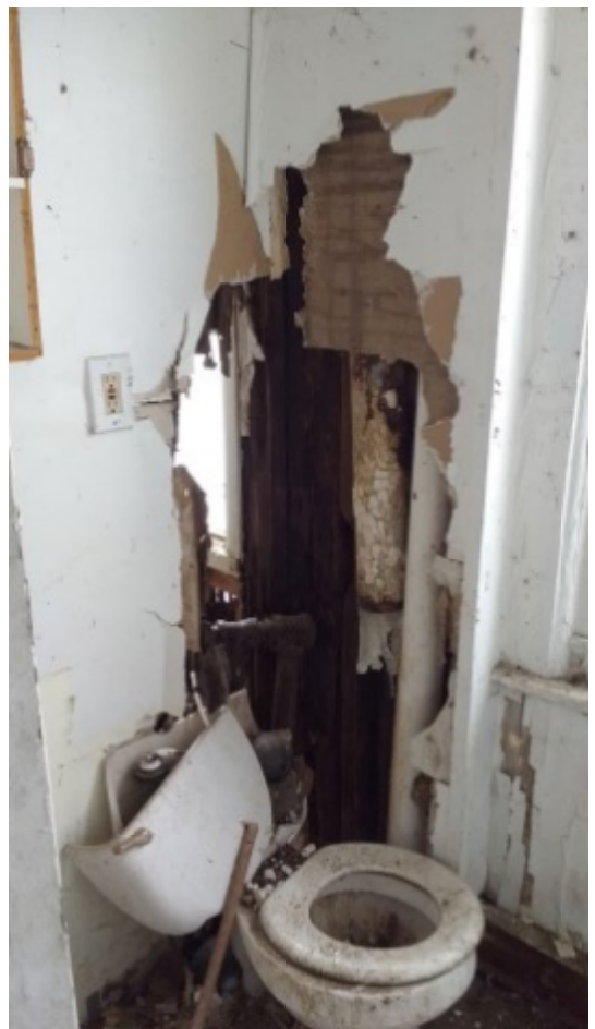
320 Second St 12.jpg