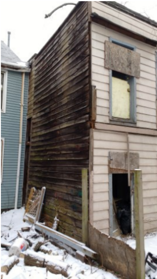
320 Second St 05.jpg