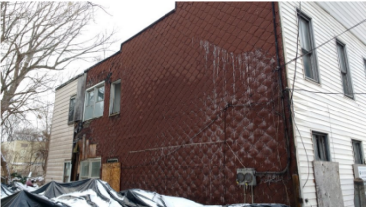
320 Second St 03.jpg