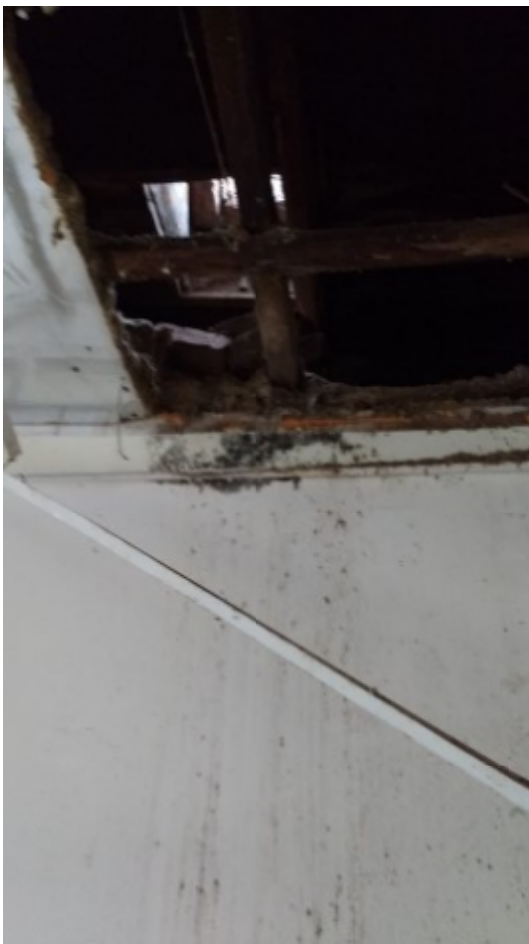
320 Second St 11.jpg