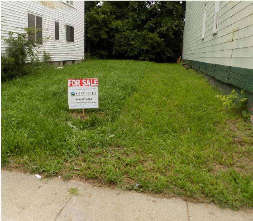
All lots listed for sale are posted with Albany County Land Bank For Sale signs.