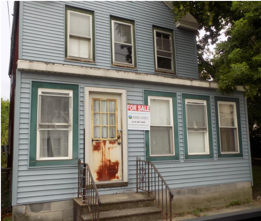
All buildings listed for sale are posted with Albany County Land Bank For Sale signs.