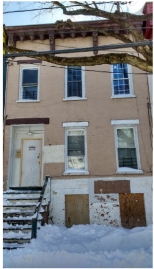
308 First St 02.jpg