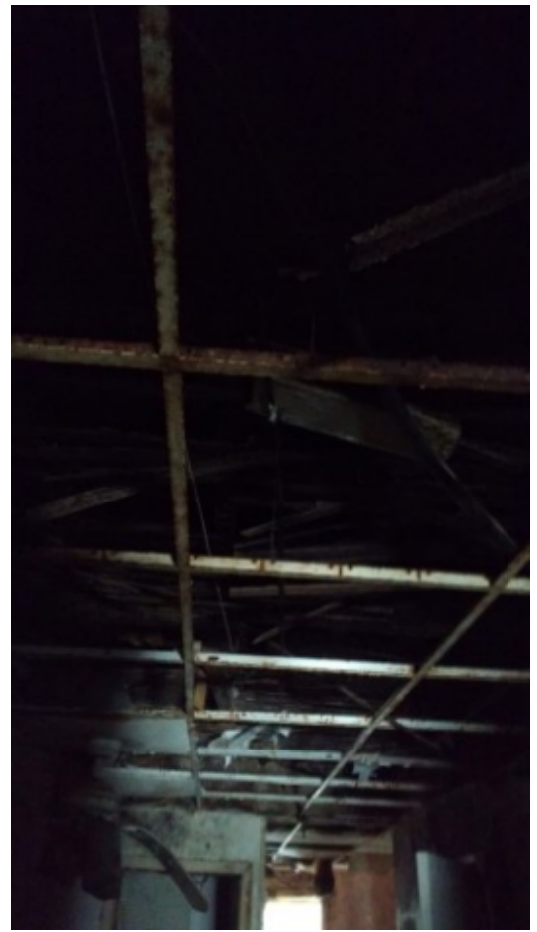
308 First St 10.jpg