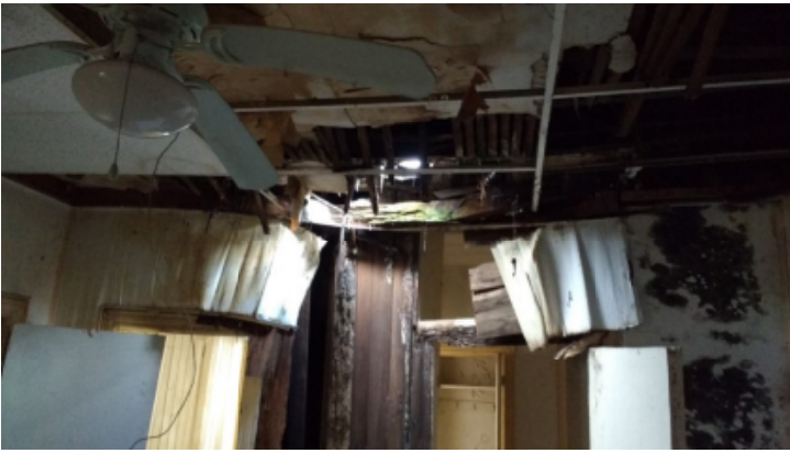
308 First St 05.jpg