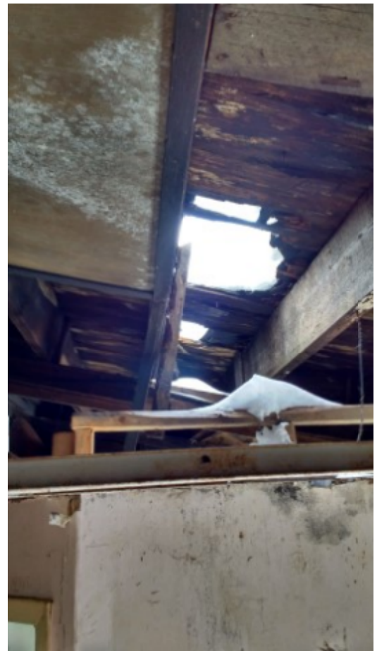
308 First St 08.jpg