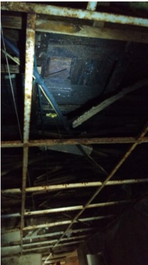
308 First St 11.jpg