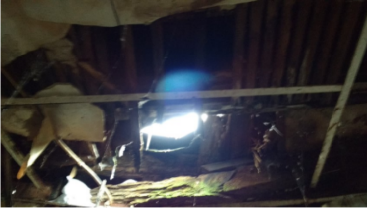
308 First St 09.jpg