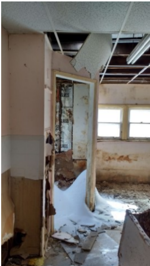
308 First St 07.jpg