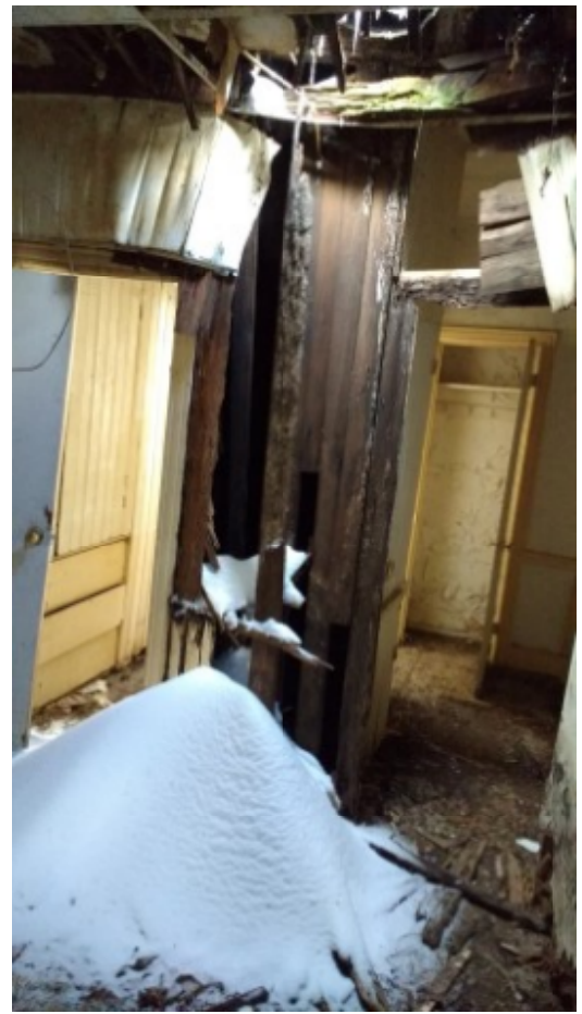
308 First St 06.jpg