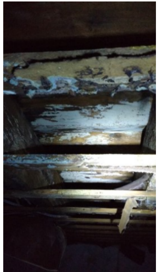
308 First St 12.jpg