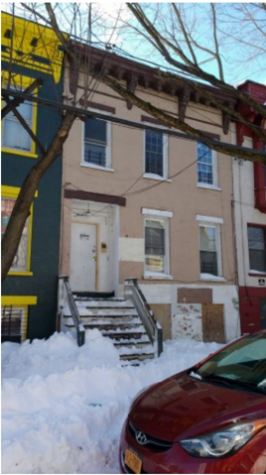
308 First St 01.jpg