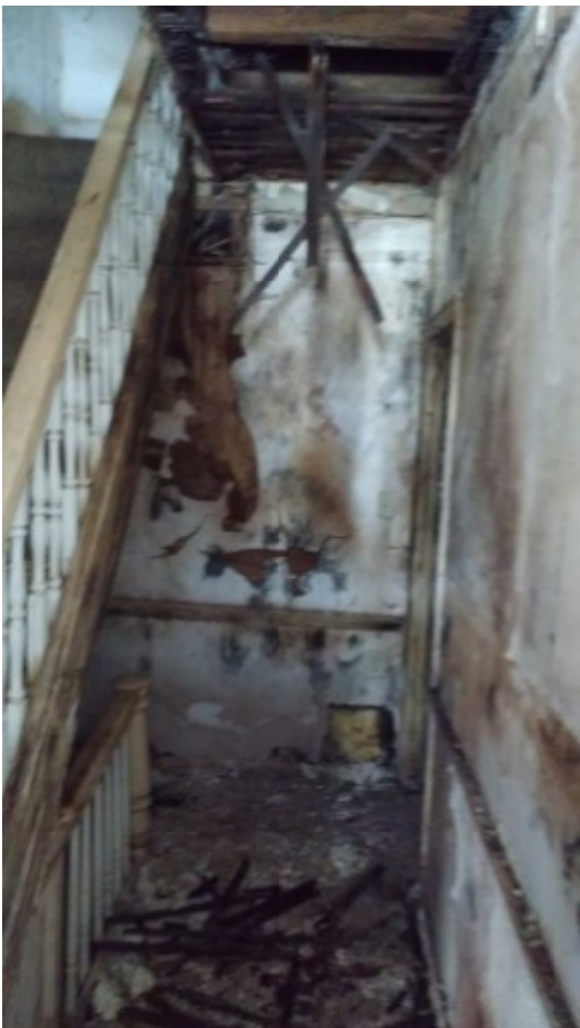
308 First St 03.jpg