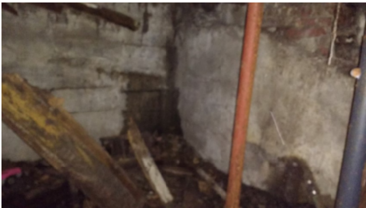
136 Livingston Ave 11.jpg