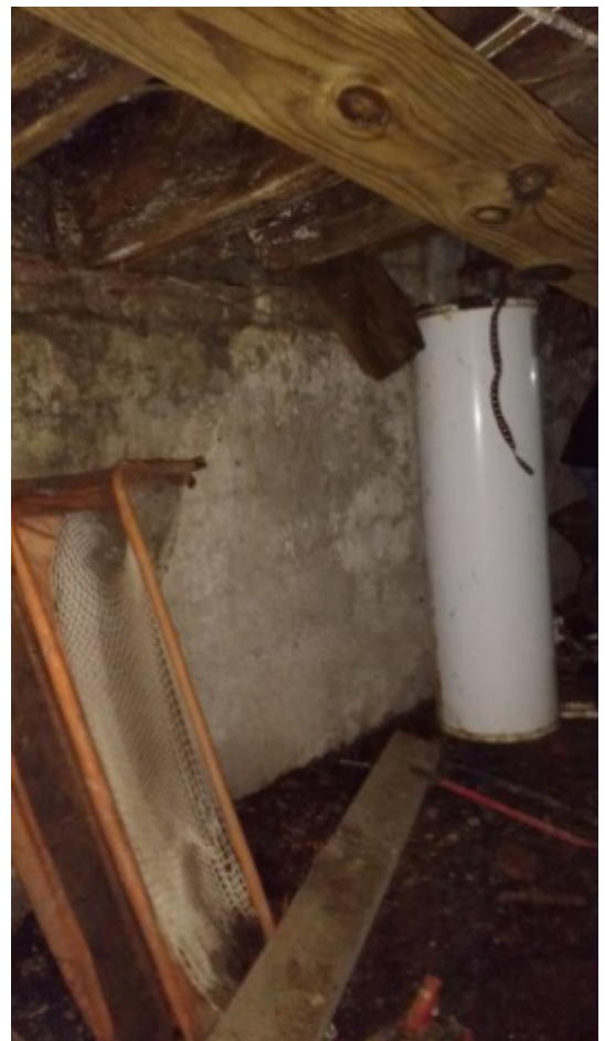
136 Livingston Ave 12.jpg