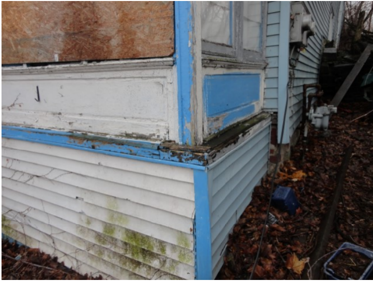
136 Livingston Ave 05.JPG