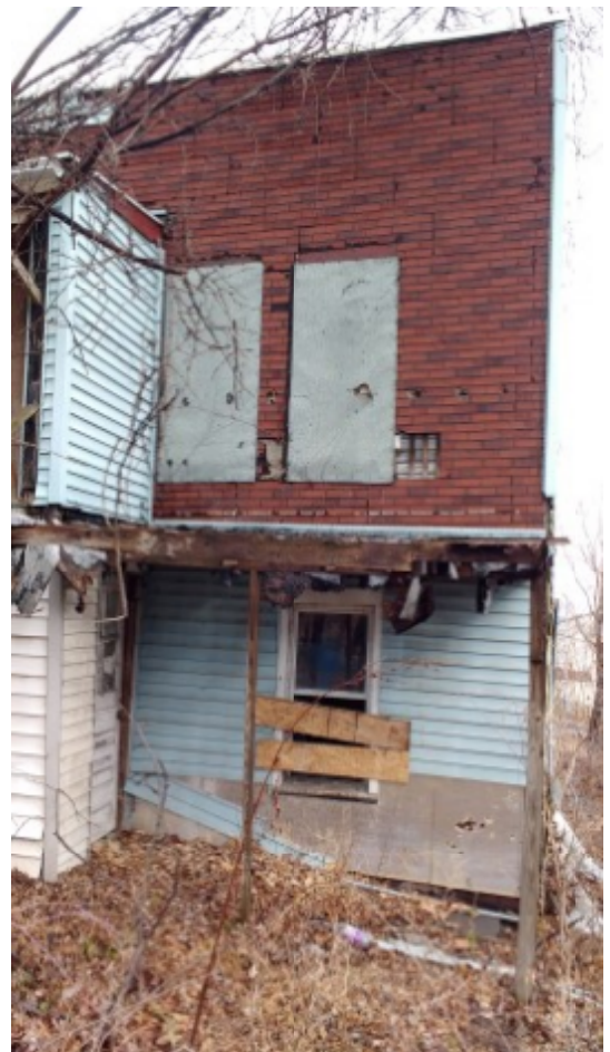
136 Livingston Ave 04.jpg