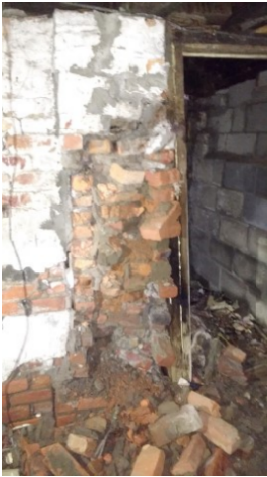
136 Livingston Ave 09.jpg