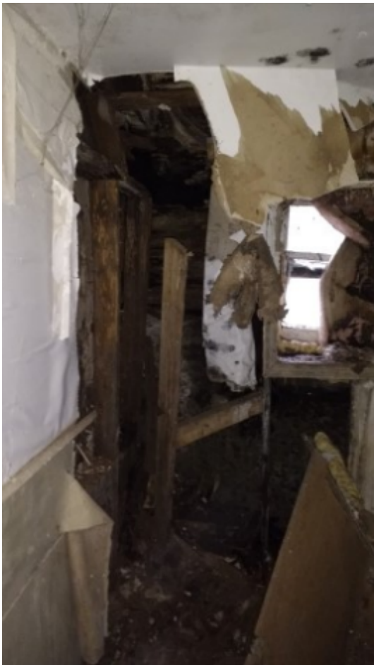
136 Livingston Ave 07.jpg