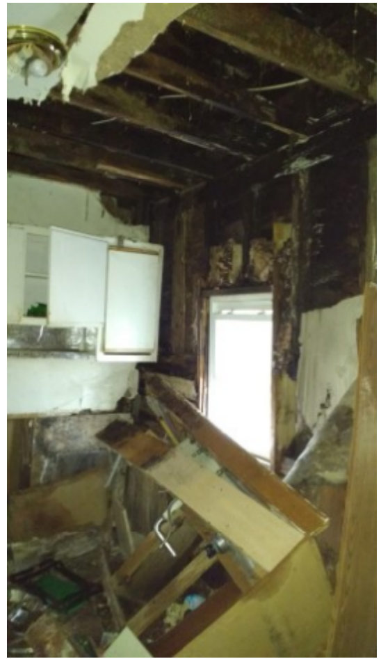
136 Livingston Ave 14.jpg