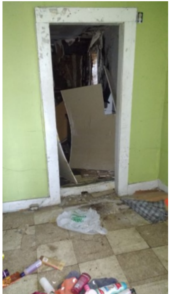
136 Livingston Ave 08.jpg