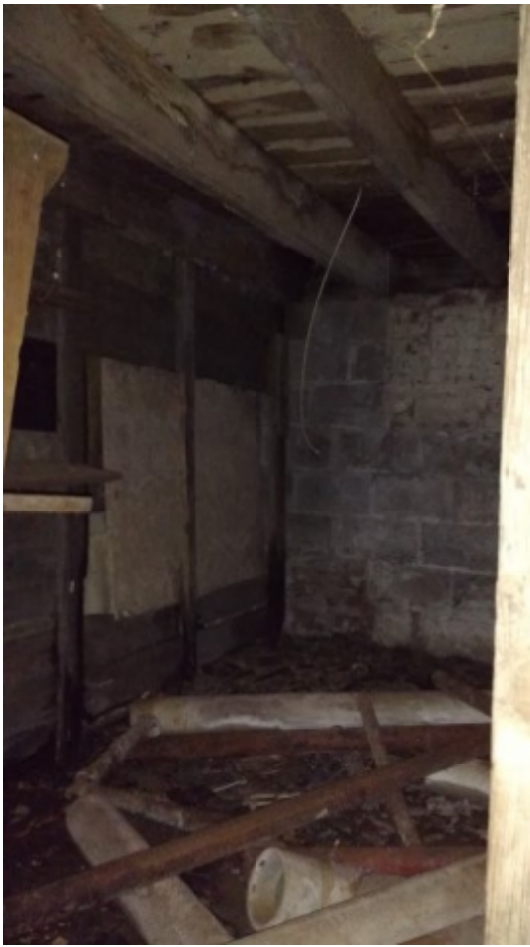
136 Livingston Ave 13.jpg