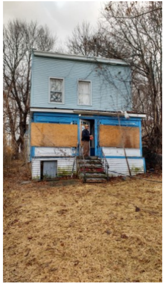
136 Livingston Ave 02.jpg