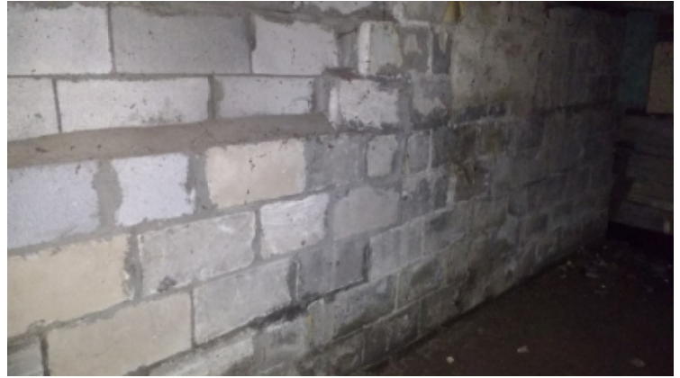
136 Livingston Ave 10.jpg