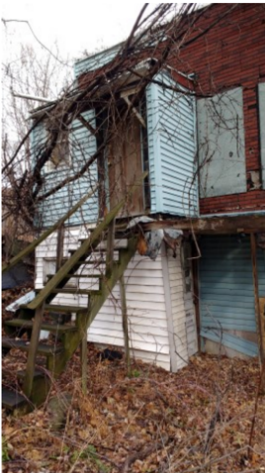
136 Livingston Ave 03.jpg