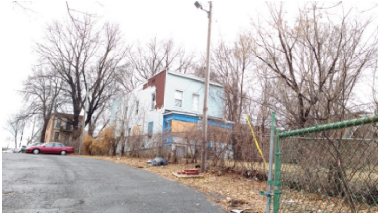
136 Livingston Ave 01.jpg