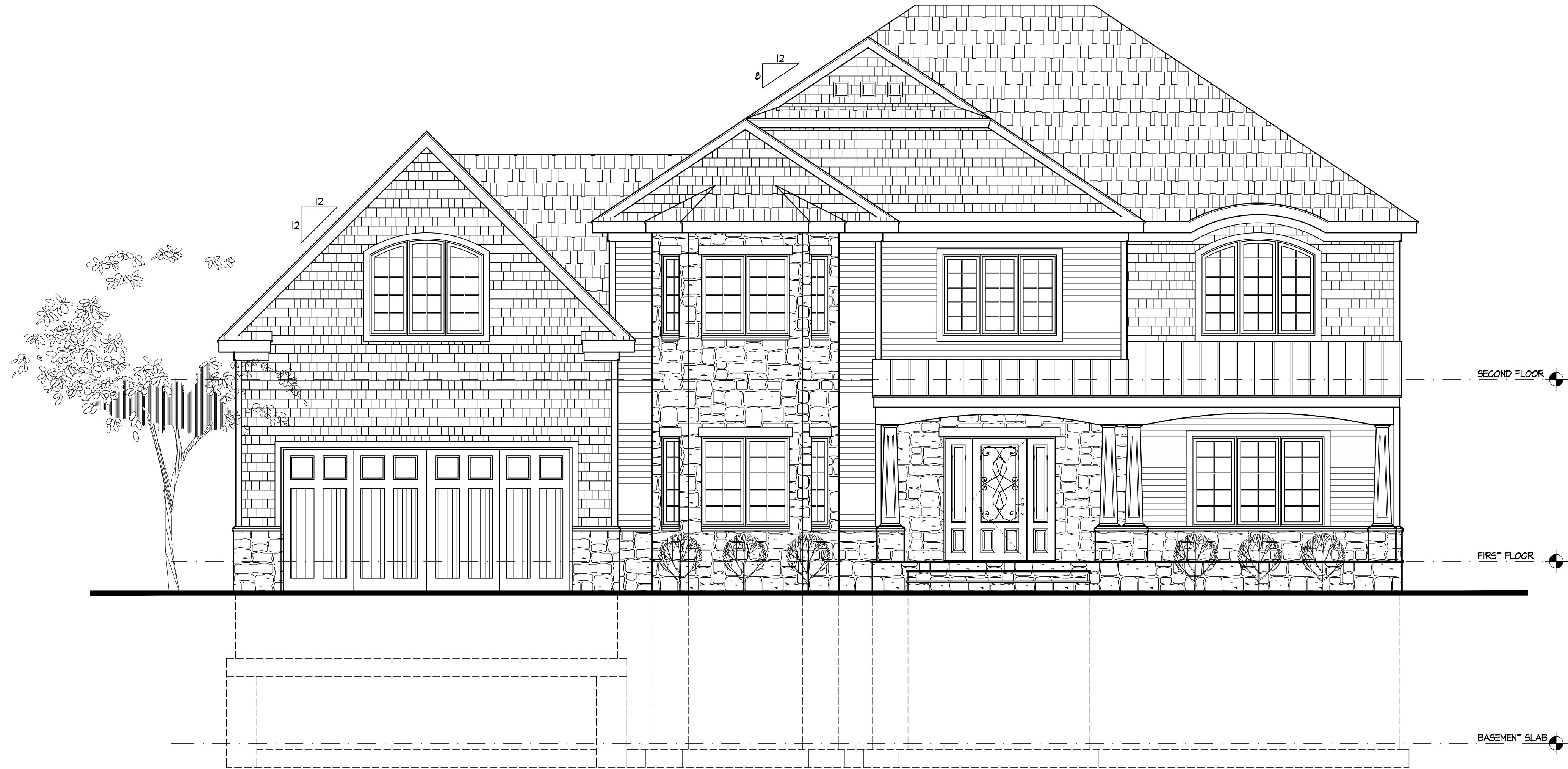
○ FRONT ELEVATION SCALE: 1/4"=1'-0" DATE: 04/19/2017

ROSENBLUM RESIDENCE 197 HOLMES DALE AVENUE, ALBANY, NY