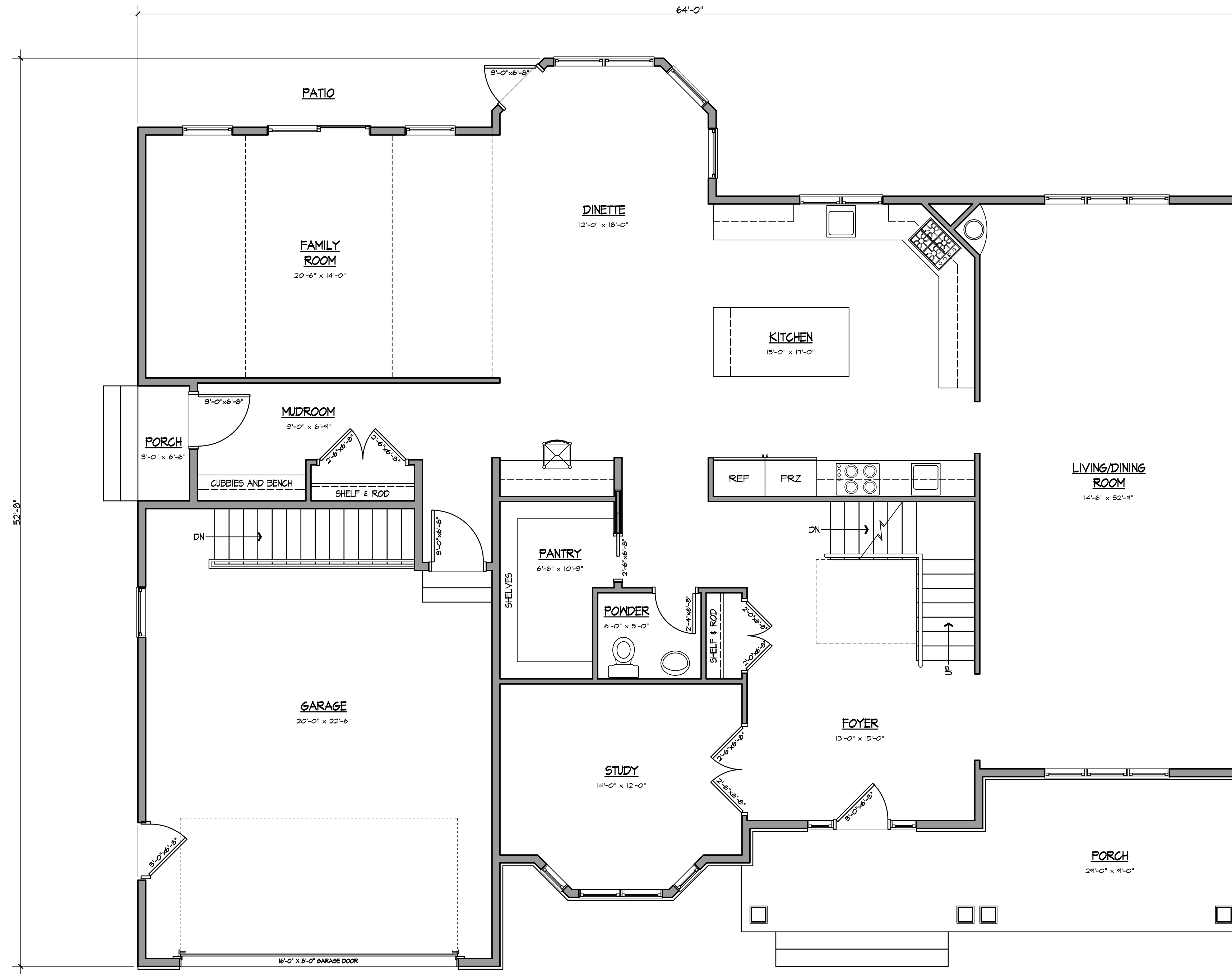
FIRST FLOOR PLAN SCALE: 1/8"=1'-0"

FLOOR AREA = 2,132 SF + 540 SF GARAGE + 236 SF PORCHES = 2,910 SF