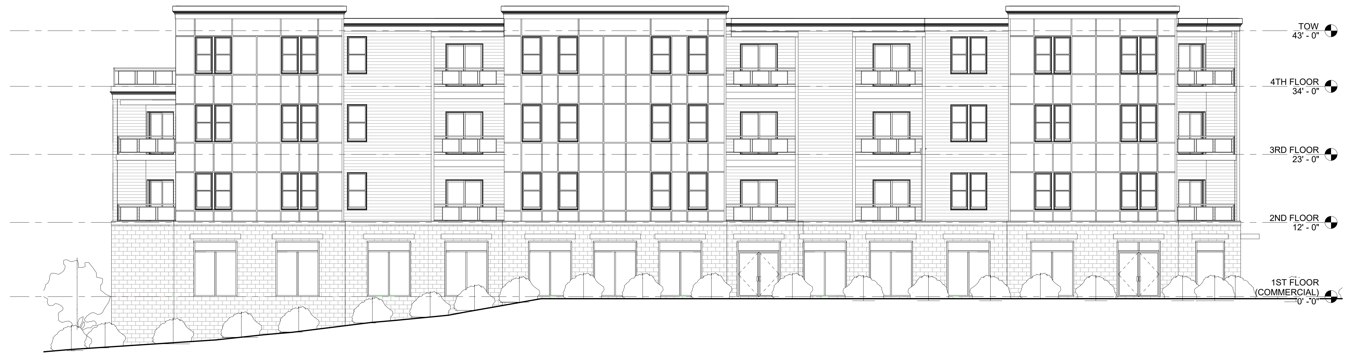
1 EAST ELEVATION ONTARIO STREET 1/8" = 1'-0"

TOW 43' - 0" 4TH FLOOR 34' - 0" 3RD FLOOR 23' - 0" 2ND FLOOR 12' - 0" 1ST FLOOR (COMMERCIAL) 0' - 0"