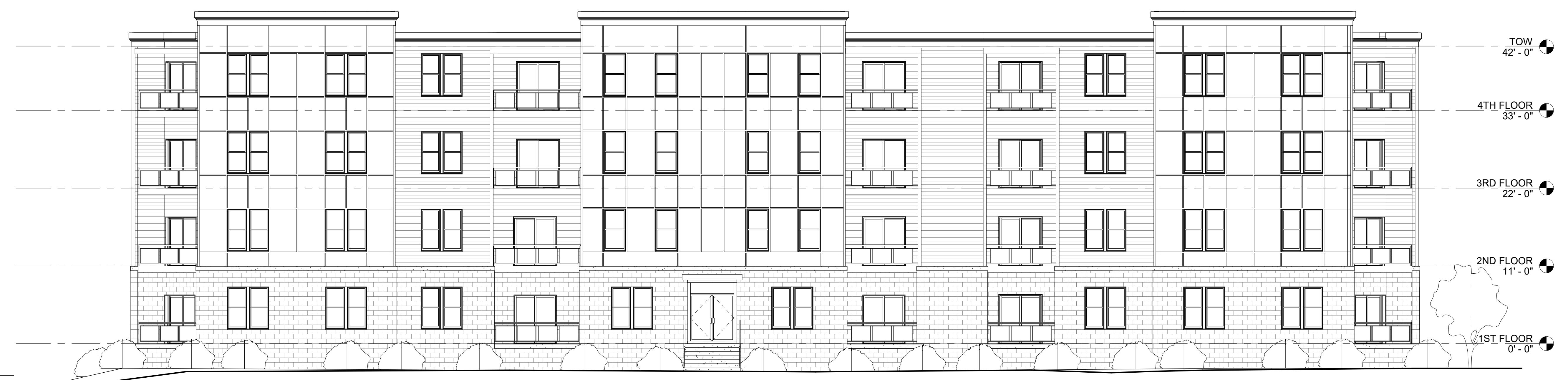
1 NORTH ELEVATION (PARK) 1/8" = 1'-0"

HARRIS A. SANDERS ARCHITECTS, P.C. 252 WASHINGTON AVENUE, ALBANY, NEW YORK 12210 PLAYDIUM BUILDING 1 363 ONTARIO STREET ALBANY, NEW YORK