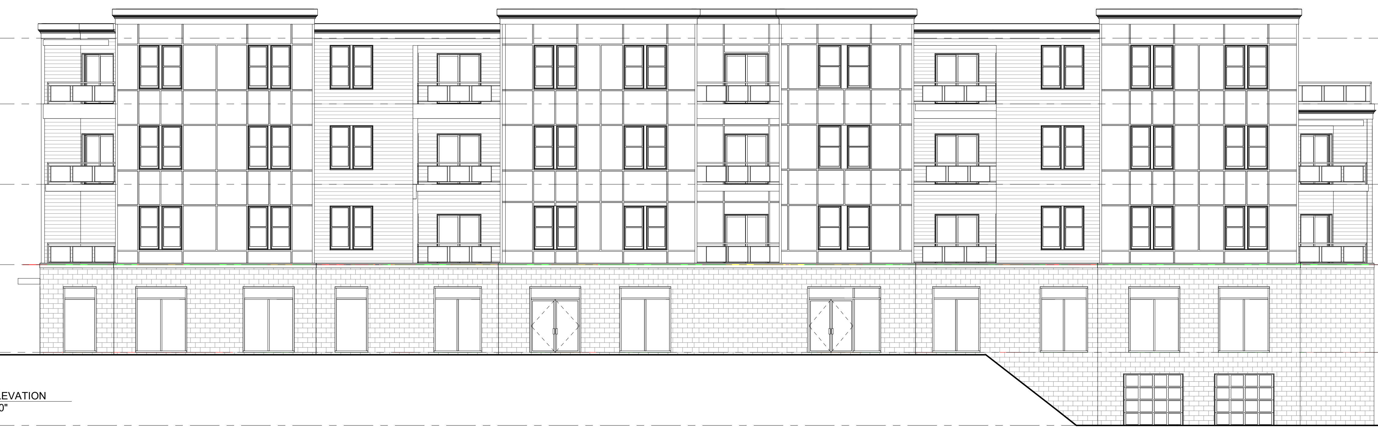
4 WEST ELEVATION 1/8" = 1'-0"

TOW 43' - 0" 4TH FLOOR 34' - 0" 3RD FLOOR 23' - 0" 2ND FLOOR 12' - 0" 1ST FLOOR (COMMERCIAL) 0' - 0" BASEMENT (PARKING) -10' - 0"