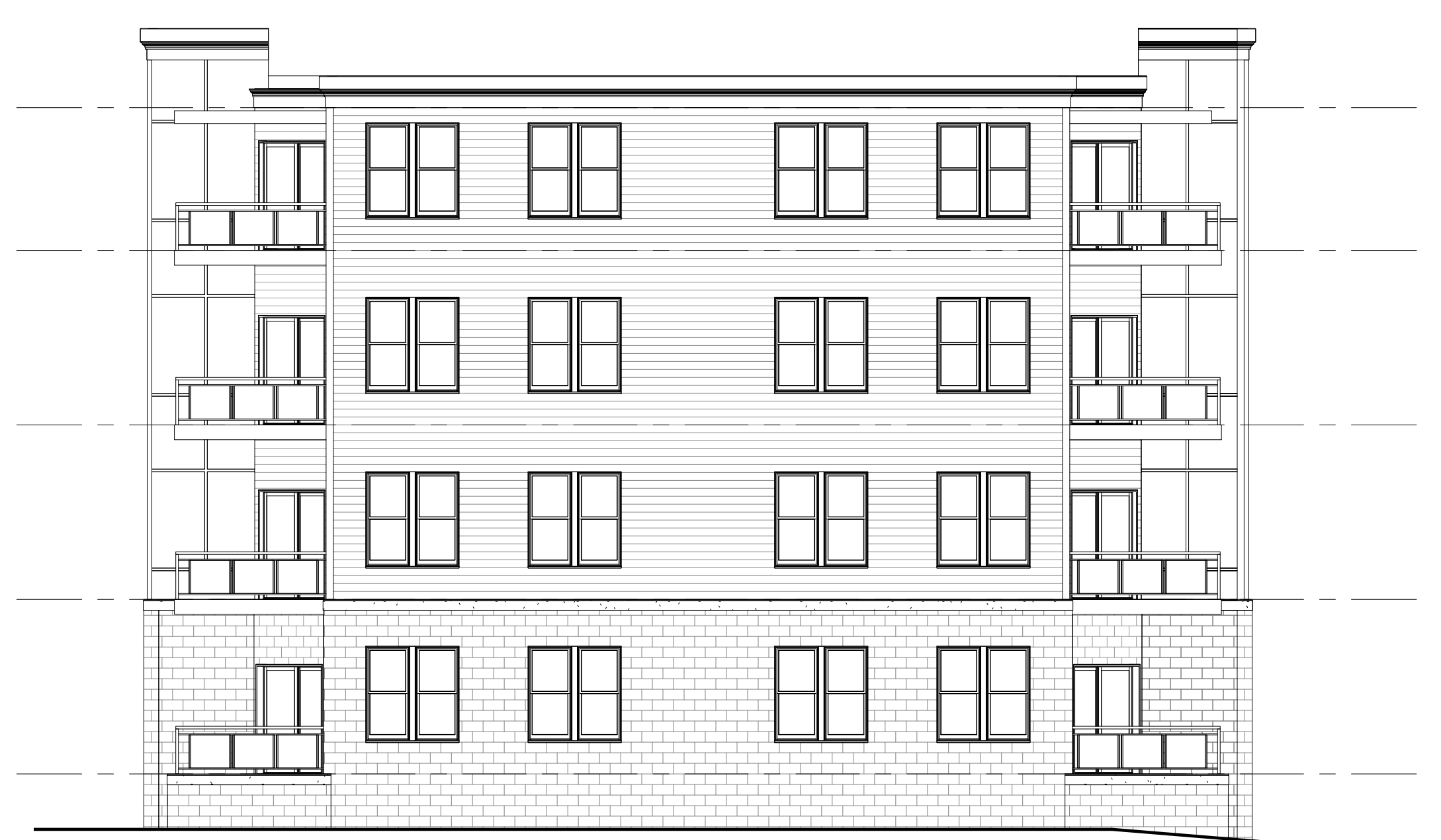
2 WEST ELEVATION 1/8" = 1'-0"