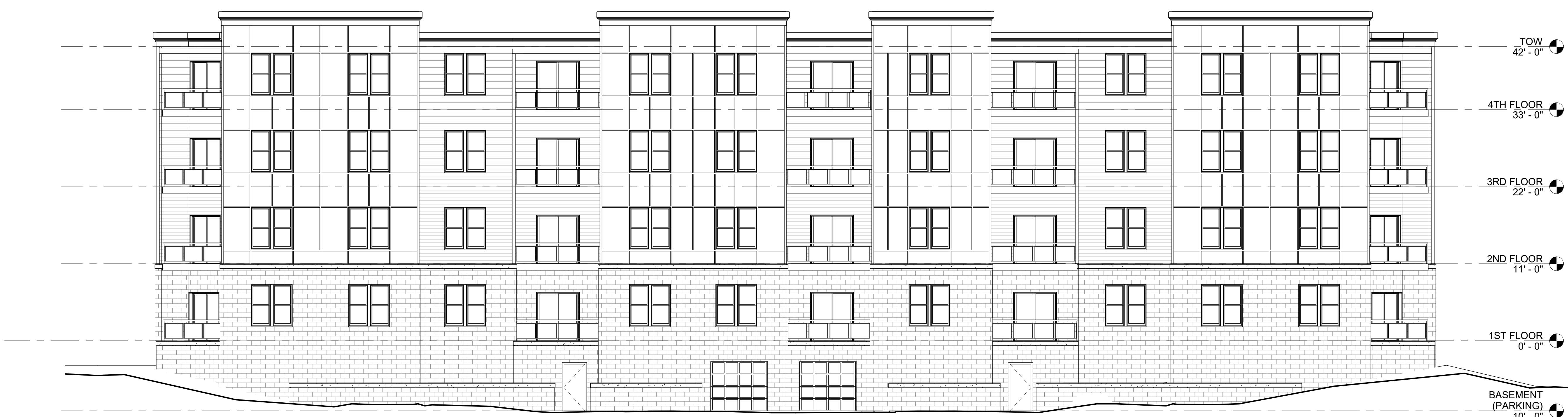
4 FRONT ELEVATION 1/8" = 1'-0"