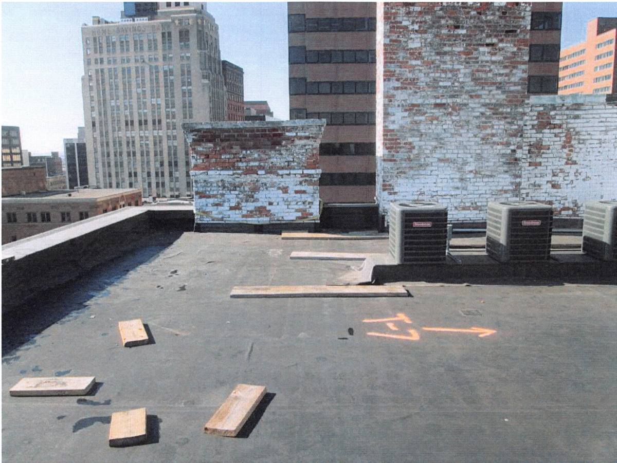
View southerly from roof