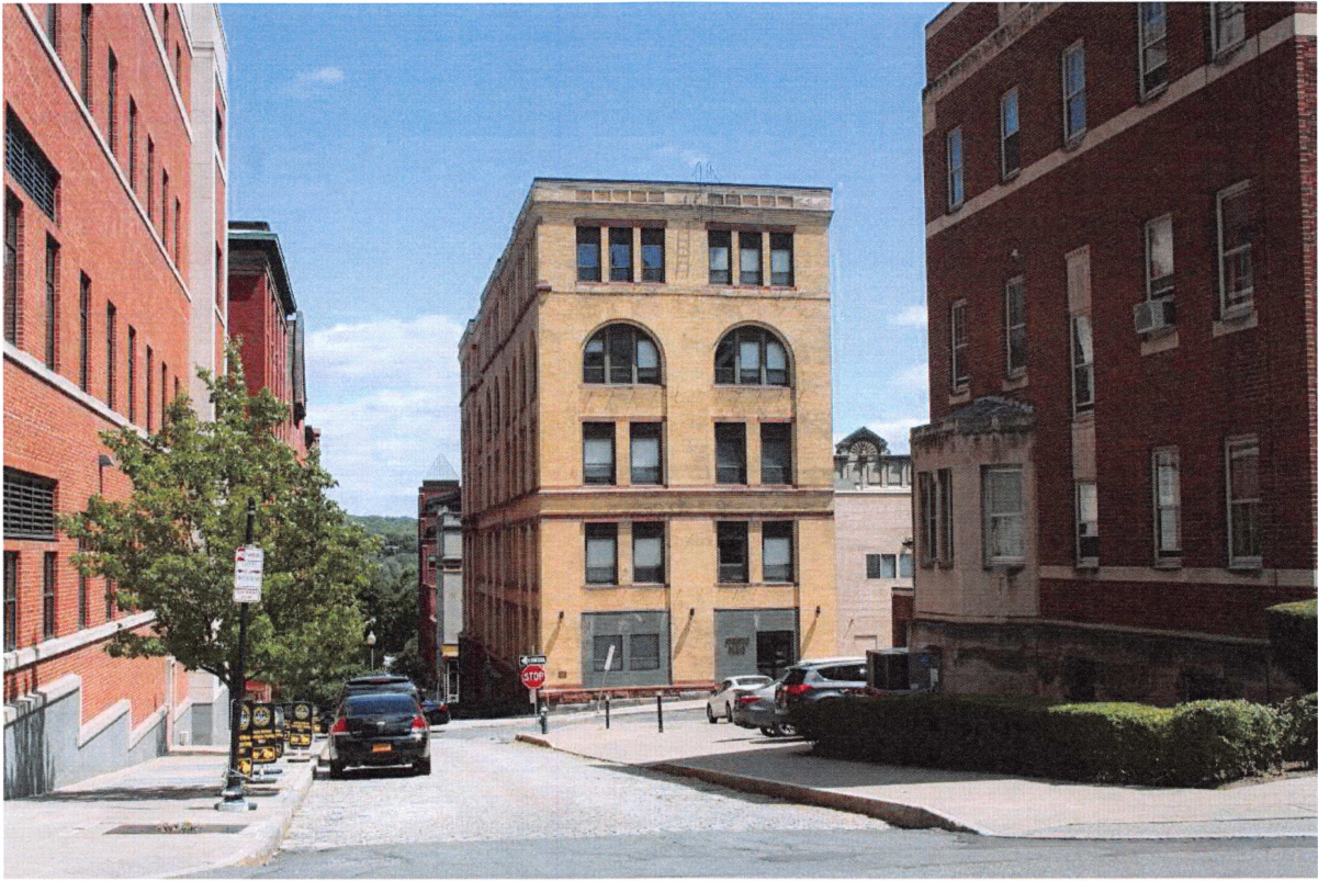
View easterly from the intersection of Steuben Street and Lodge Street