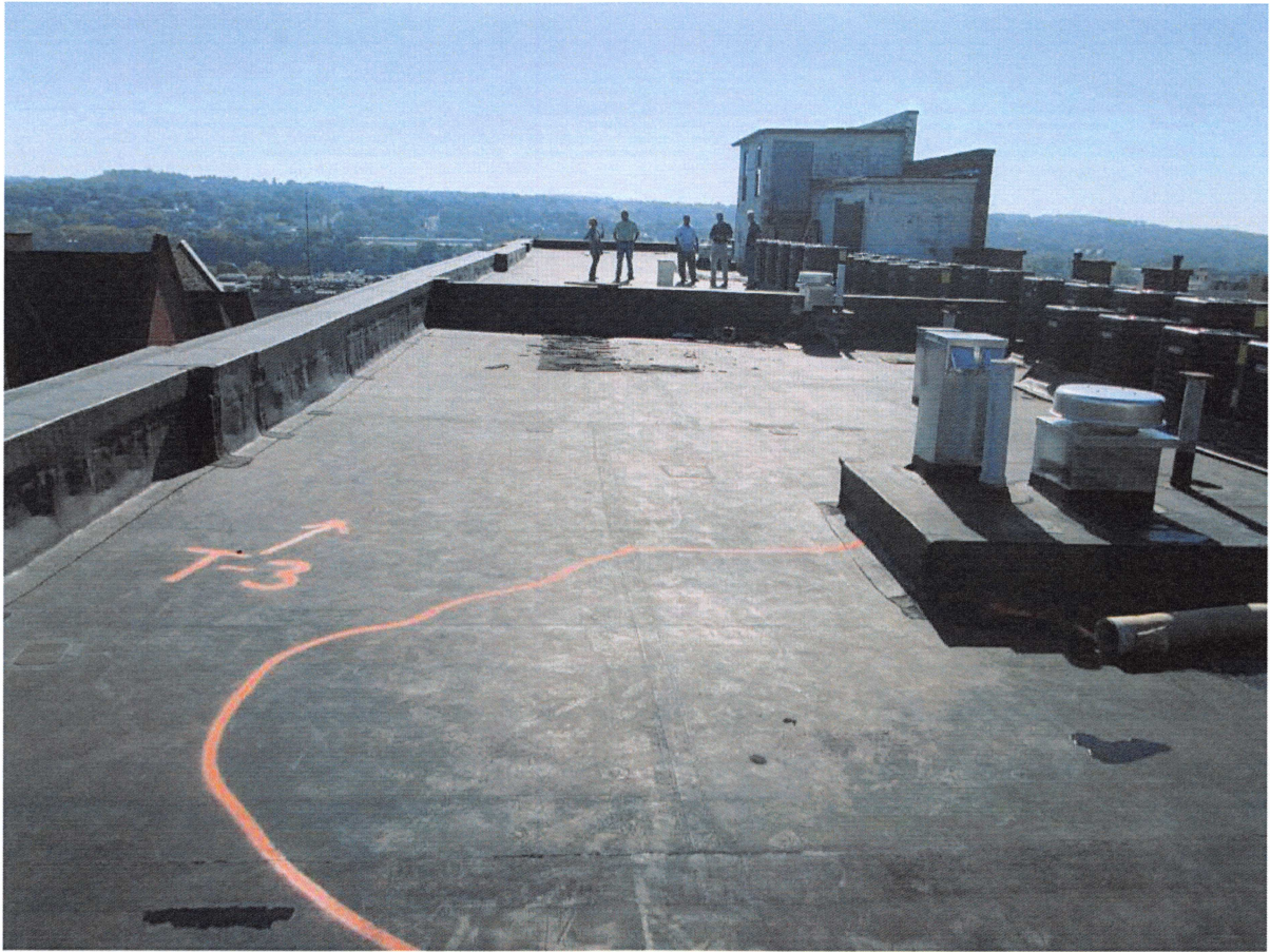
View easterly from roof