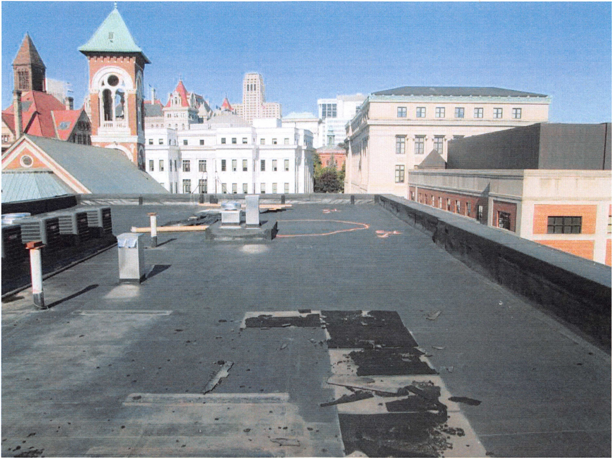
View westerly from roof