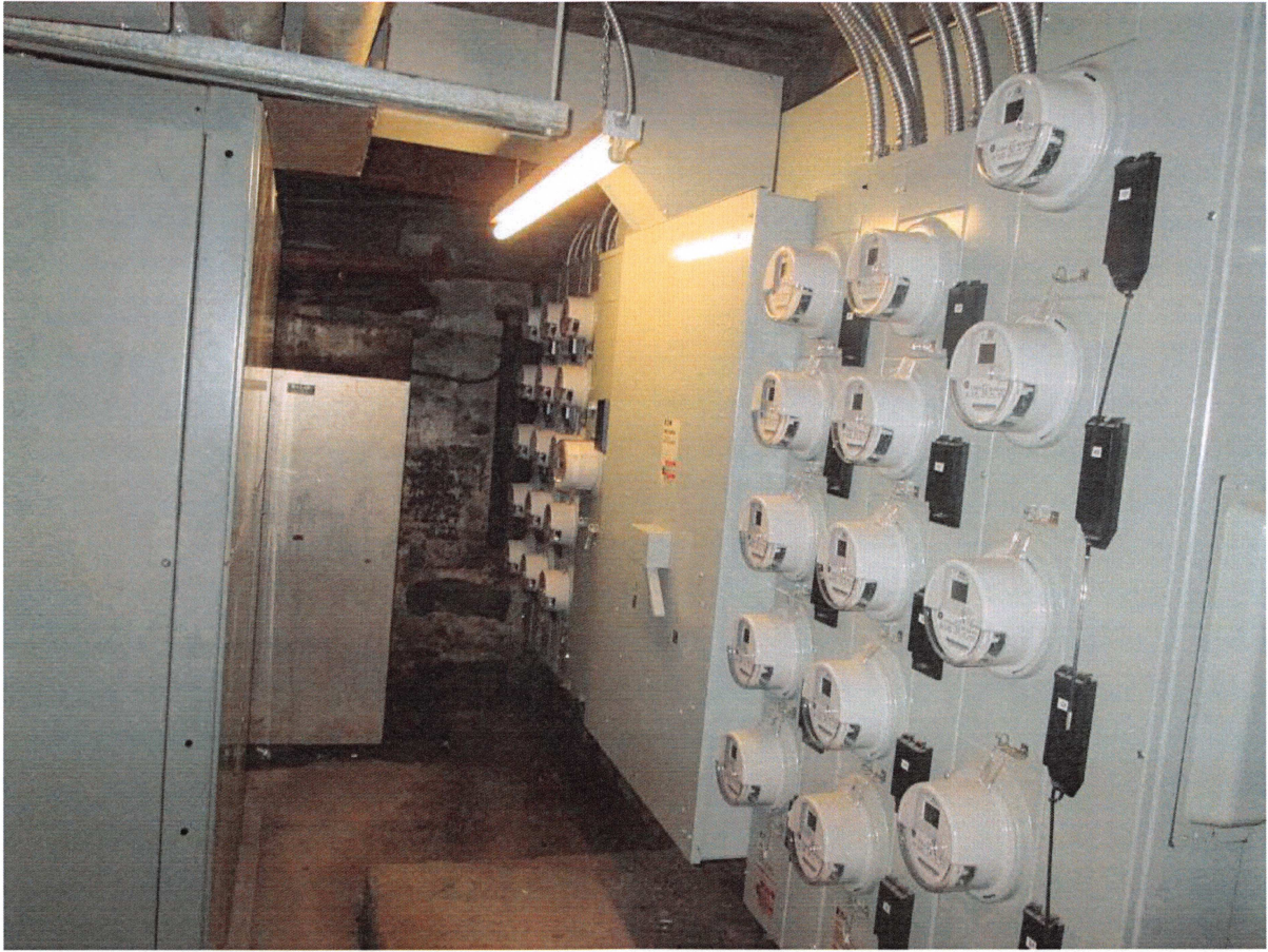
View southeasterly from basement