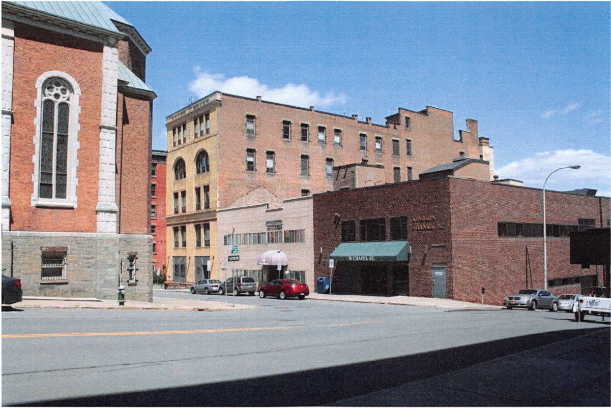
View northerly from Pine Street