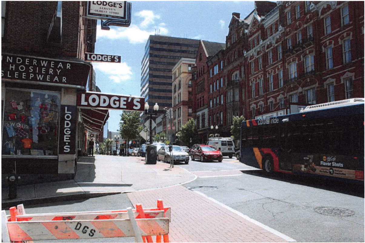
View southerly from the intersection of N. Pearl Street and Columbia Street