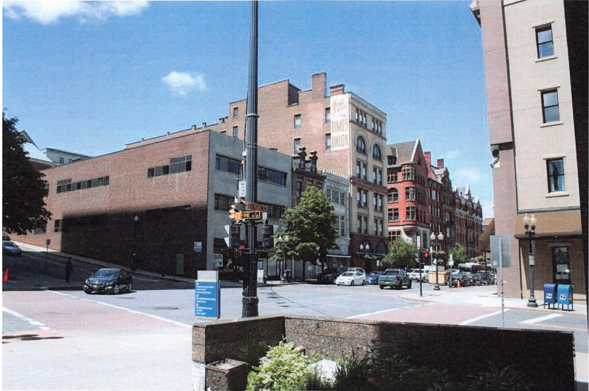
View westerly from the intersection of N. Pearl Street and Pine Street