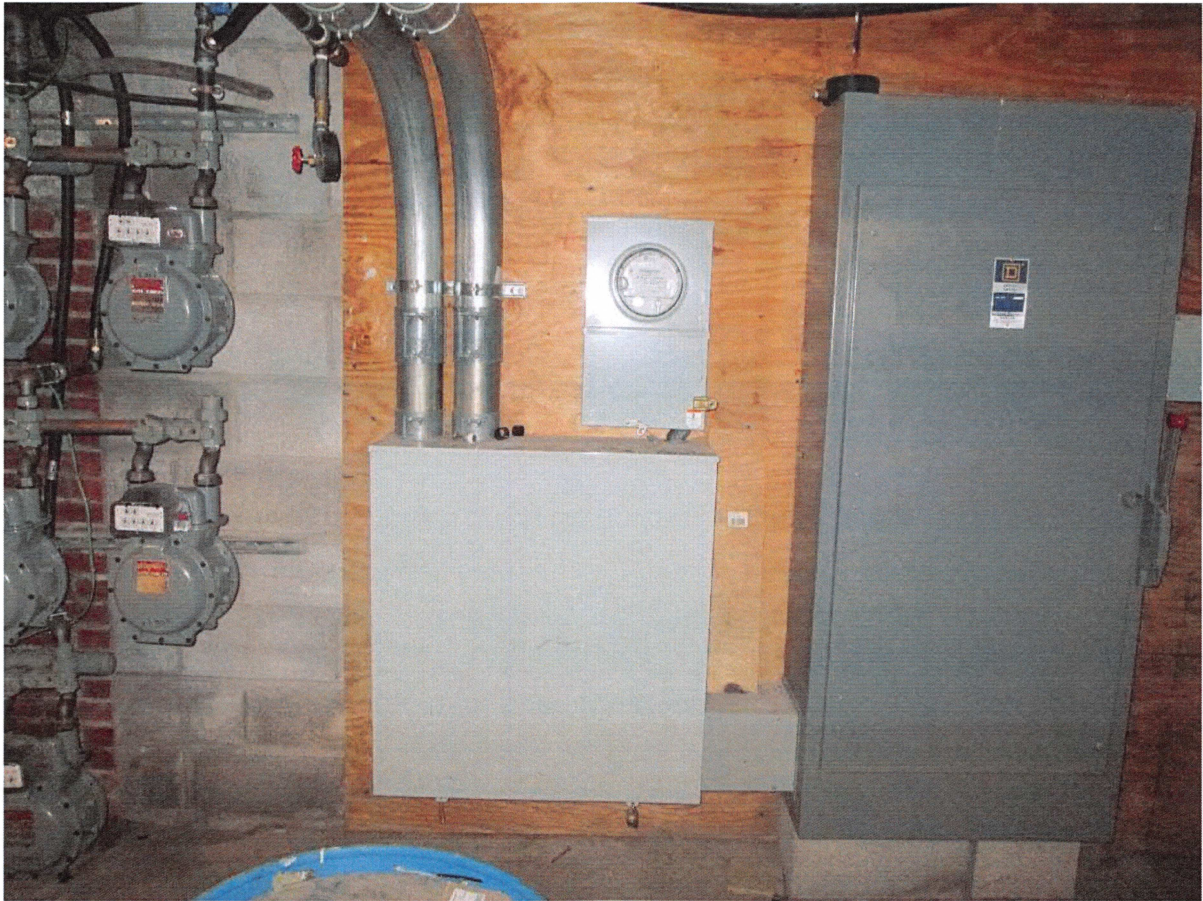
View easterly from basement