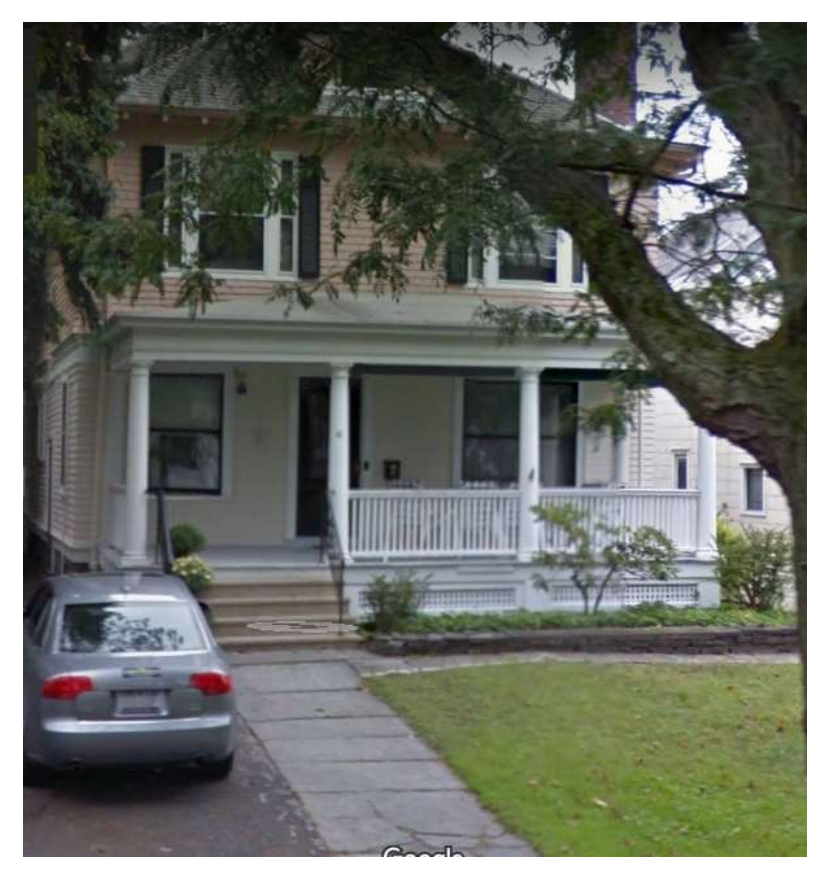
Existing 41 South Pine Avenue