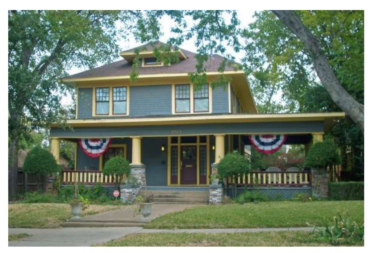
Note stone bases for wood columns