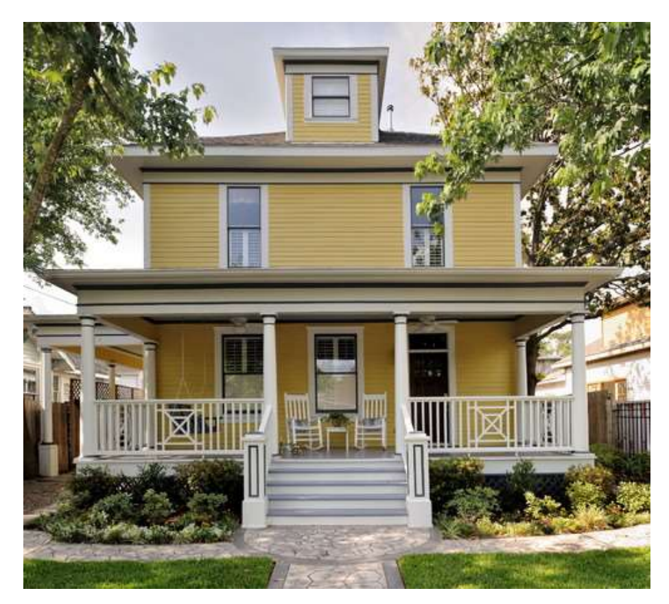
Note center stair location with identical window and door locations