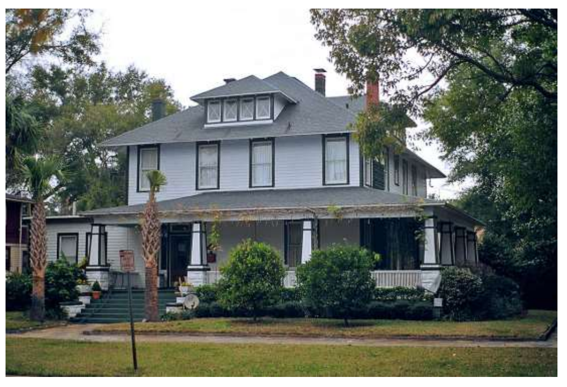
Note stone bases for wood columns